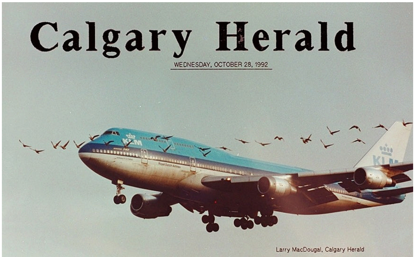
Figure 3 Boeing 747 Encounter with a Flock of Canada Geese just prior to Bird Ingestion in Outboard Left Wing Engine. Birds appear to be unaware of aircraft's presence.

An illustration of a geese flock exposure with single engine ingestion was a Boeing 747 encounter with a flock of Greater Canada Geese on approach to Calgary in 1992. This encounter is shown in Figures 3 and 4. This event resulted in one goose being ingested in the left outboard engine. Damage to the engine was heavy and fortunately there was no significant power loss.