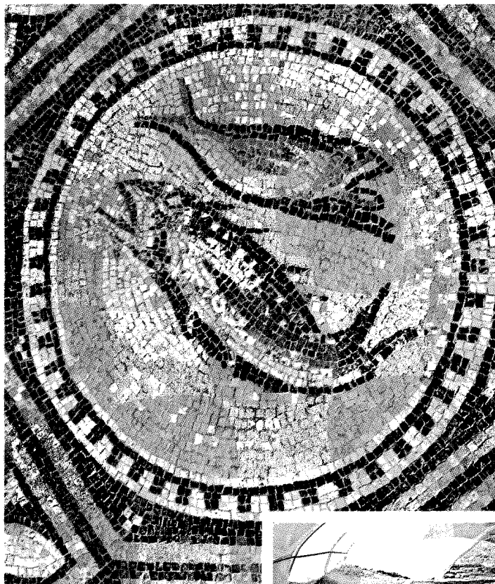
The mosaic floor from a third-century church (above) displays early Christian iconography. It was found during an excavation (right) for the expansion of an Israeli prison.

If the early Christians were right, it won't be the last time the church is demolished. The name "Megiddo" was later corrupted into "Armageddon"—the site, they believed, of the final showdown between good and evil just before the end of the world. —Zach Zorich