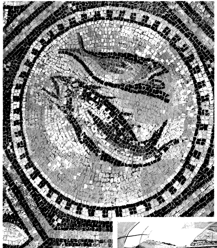
The mosaic floor from a third-century church (above) displays early Christian iconography. It was found during an excavation (right) for the expansion of an Israeli prison.

If the early Christians were right, it won't be the last time the church is demolished. The name "Megiddo" was later corrupted into "Armageddon"—the site, they believed, of the final showdown between good and evil just before the end of the world. —Zach Zorich