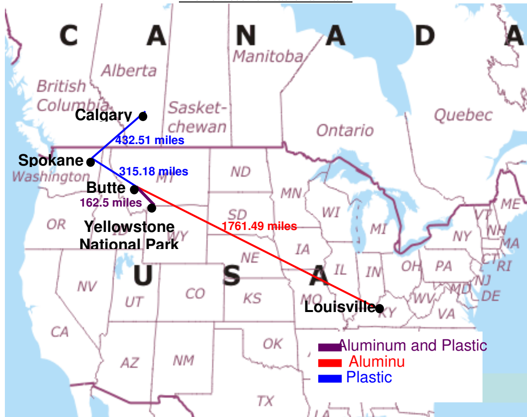
Figure 1. Shipping Distances of Recovered Aluminum and Plastic from Yellowstone National Park

Finally, the fuel mileage of a semi tractor trailer carrying approximately the same amount as the trucks was found in a reputable publication. This publication stated that the average fuel mileage is 5.8 miles per gallon for trucks that are able to carry 22.5 tons of material (Davis, 2007).