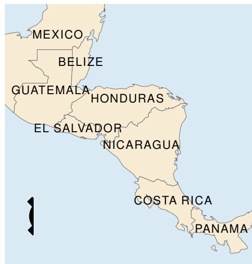
Figure 1 Location of Honduras

My study area is located in Honduras, a fairly mountainous country that has temperate forests well suited for growing Coffea arabica , the most widely produced coffee species, for