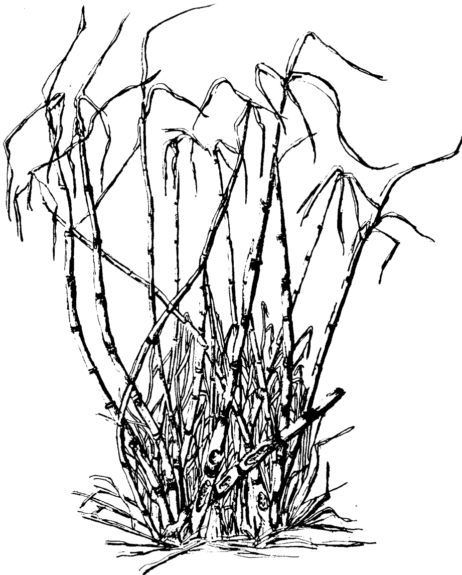
Fig. 2. Rat-damaged sugarcane

Development of sugarcane varieties that are less susceptible to damage by rats is a promising avenue for research. Possible selection criteria