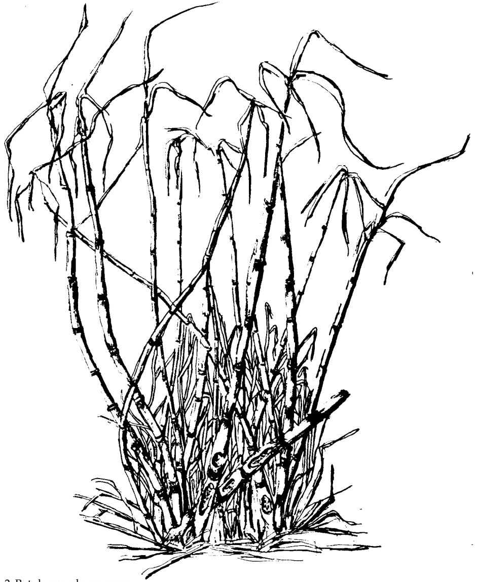
Fig. 2. Rat-damaged sugarcane

Development of sugarcane varieties that are less susceptible to damage by rats is a promising avenue for research. Possible selection criteria