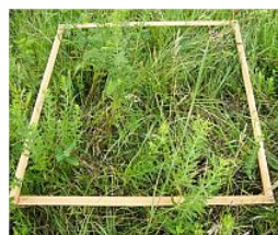
Sampling Plot

Lindsey Reinarz has finished three samples of herbivory rates and insect sweeps. Insect analysis and identification are nearly complete.