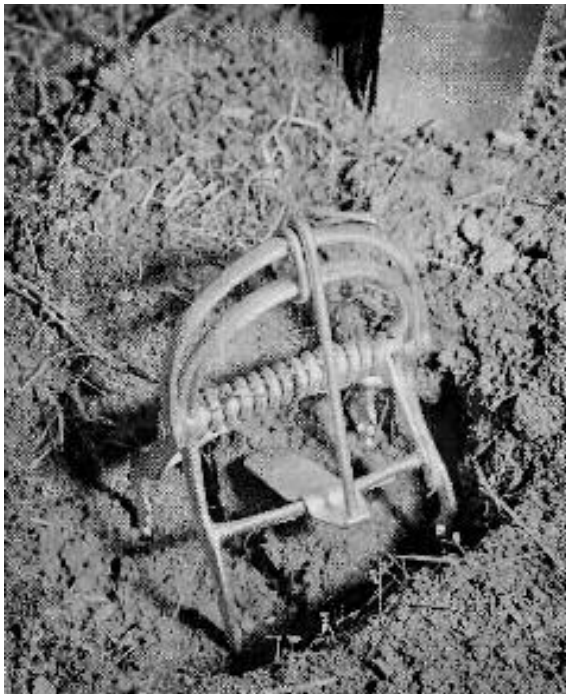
Fig. 3. Jaw type mole trap set in excavated hole to straddle mole run.