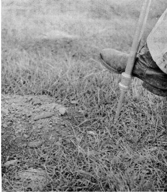
Fig. 1. Locating mole runway with steel probe •