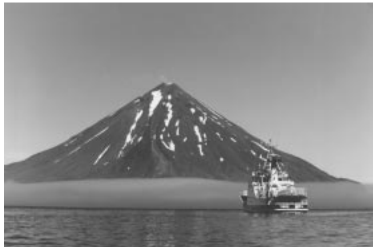
MV Tiglax at Chuginadak. Alaska