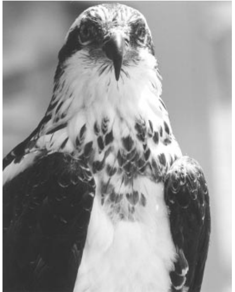
Osprey.