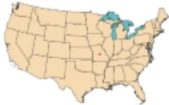
Black carp ( Mylopharyngodon piceus ) ■ Drainages with introductions

tive Resource Association (MICRA), that the U.S. Fish and Wildlife Service regulate the use of black carp by placing it on the federal list of injurious wildlife species under the Lacey Act. Most states feel that black carp pose a serious threat to native mollusk and snail species, many of which are federally listed as threatened or endangered. Meanwhile, Mississippi, Arkansas, Texas and Missouri permit stocking of genetically altered and presumably sterile black carp in fish farm ponds. Missouri has also initiated a 5-year program to supply limited numbers of genetically altered black carp to fish farmers in the hope that state officials will be more successful than private operators in preventing the escape and spread of this non-native species.