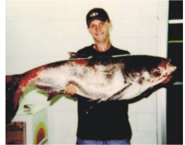
Bighead carp (50 lbs) caught in the Cumberland River, Tennessee in May 2000.

Four species of large Asian carps (grass, bighead, silver and black) have been imported into the U.S. for use in the aquaculture industry, and biologists are raising more and more concerns about their effect on native fish and shellfish when released or escaped to the wild. In fact, in the fall of 1999, fish kills in isolated ditches adjacent to the Upper Mississippi River on the Mark Twain National Wildlife Refuge in southern Illinois included large numbers (97%) of Asian carps, but only one individual each of four native fish species. After that incident, reports came in of commercial fishermen having to abandon fishing sites on the Missouri River because they were catching so many Asian carps that they found it impossible to raise their nets. The common carp, introduced by European immigrants in the 1800's as a food fish, has become so widespread in the U.S. that in most areas it is considered part of the native fauna. The fear is that in time the other four Asian carps will become as widely distributed and abundant, wreaking widespread havoc with native fish and shellfish habitats and foods.