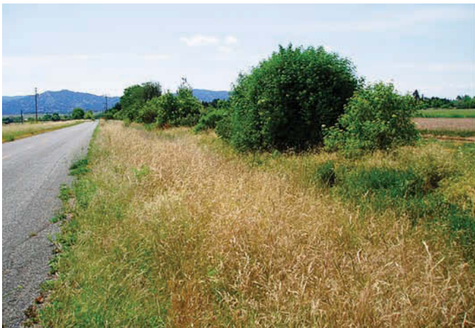
At relatively undisturbed site 1 (looking west), vegetation from the road edge (left) to swale (bottom right to center) is dominated by the native perennial purple needlegrass. The swale is periodically inundated in winter and contains a few individuals of the native perennial meadow barley distributed among a dense cover of common vetch ( Vicia sativa ), an invasive annual.

California annual exotic grasslands are largely composed of the species Italian ryegrass ( Lolium multiflorum Lam.), soft chess ( Bromus hordeaceus L.), ripgut grass ( Bromus diandrus Roth), wild oat ( Avena fatua L.), medusa-head ( Taeniatherum caput-medusae [L.] Nevski) and foxtail barley ( Hordeum murinum L.). Yellow starthistle ( Centaurea solstitialis L.) and broadleaf filaree ( Erodium botrys [Cav.] Bertol.) form a large component of the associated invasive annual broadleaf biomass (Heady et al. 1992; Lulow 2004; Pitcairn et al. 2006). Except for yellow starthistle, all of these invasive species complete their life cycles by the time soils become dry in the summer