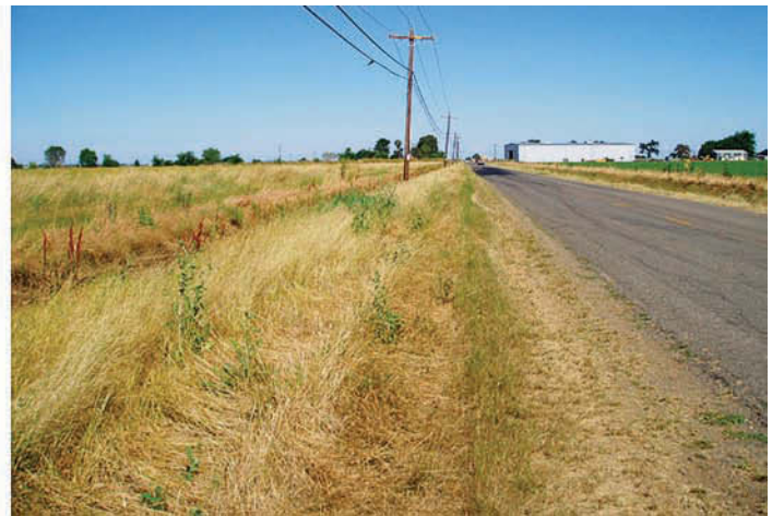
The road edge of heavily traveled site 4 (looking east) is bare (bottom right to center). A dense strip of stunted, invasive annual grasses (Italian ryegrass and foxtail barley) occurs to the left of the road edge on the shoulder (bottom center to center). A strip of the native perennial purple needlegrass occurs on the much-less-disturbed backslope (bottom left to center).