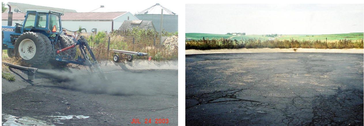
Figure 4: Application of rubber cover on the manure storage structure at the field trial site in Manning, Iowa (left) and rubber cover after application on the manure storage (right).

Emissions from the basin were monitored by Dr. Dwaine Bundy, Iowa State University, IA for odors, NH 3 and H 2 S to evaluate the effectiveness of a fine ground rubber cover that was placed on the surface of the basin. Odor samples were obtained by floating an equilibrium chamber on the surface of the manure while pulling ambient air into the chamber and across the surface of the manure under the chamber. The chamber is the same type used to determine odor compliance of lagoons in Colorado. Air from the equilibrium chamber was pulled into a ten-liter Tedlar bag. The odorous air samples were evaluated within 48-hours at the Iowa State