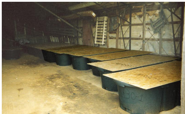
Figure 1: Lab-scale tank experiments (manure storage and lagoon tank units).

The treatment without the cover served as the control experiment. All experimental units (the tanks) were operated in triplicate.