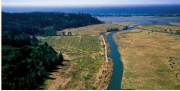
Dike was removed on the left bank of Millport Slough at Oregon Coast NWR Complex. The natural reference marsh is on the right bank.