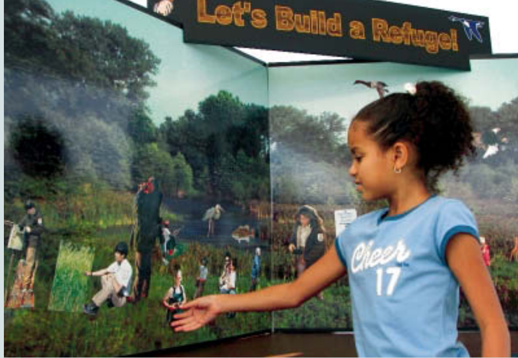
A student adds a volunteer to “the big picture that allowed youngsters to create an illustrated refuge.”

“The students enjoy making the refuge come to life,” noted Munroe-Hultman. “They take satisfaction in creating it, and we encourage them to get involved at a real refuge nearby.”