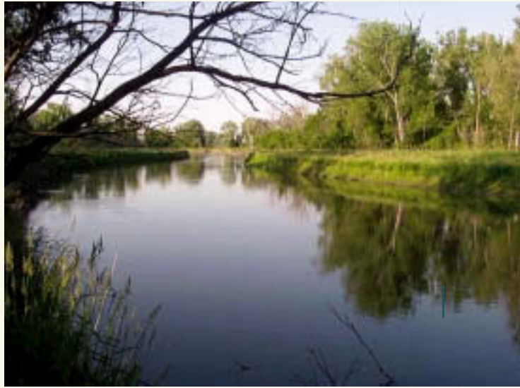
The Boyer Chute Restoration Project has restored the area to near pre-channelization condition without affecting navigation on the main stem of the Missouri River. (Jerry Grove)

The local historical society took items of interest from some of the 100-year-old farmsteads. Local neighbors, once demolition began in November 2003, took used wood, bricks and windows. One