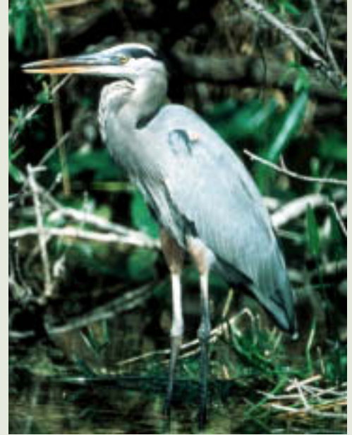
Great blue heron.

Biologists hope that the cattle's movement will create a hummock-hollow topography that yields the micro-habitat necessary for bog turtles, federally listed as a threatened species. Wallkill River Refuge is one of just two refuges that protects bog turtle habitat. For more information, contact Kevin Holcomb, 973/702-7266, or go to http://wallkillriver.fws.gov ♦