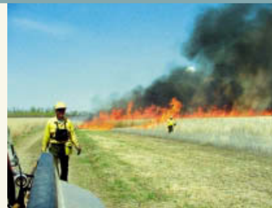
Burns are conducted on the refuge as prescribed.