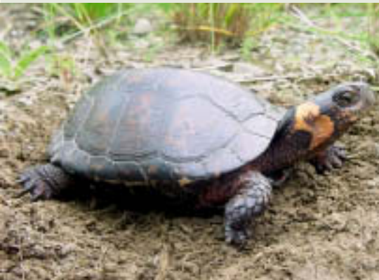
Bog turtle and its habitat are being studied at Wallkill River Refuge, NJ.

A five-year study has found that the nesting behavior of great blue herons on Missisquoi NWR, VT, was not significantly altered by the nearby presence of double-crested cormorants.