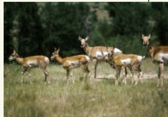
Pronghorn herd

than 300 miles of fencing have been removed since 1985, when the Buenos Aires Ranch became a refuge. Another 200 miles still need to come down. Pronghorn, reluctant to jump fences, often become entangled as they crawl under the lowest strand. The Sonoran grasslands were once home to great herds of pronghorn. By 1935, the grasslands had been overgrazed and pronghorn were gone. They were reintroduced after the refuge's establishment. ♦