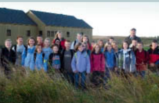
The Prairie Science Class from the Fergus Falls, MN.