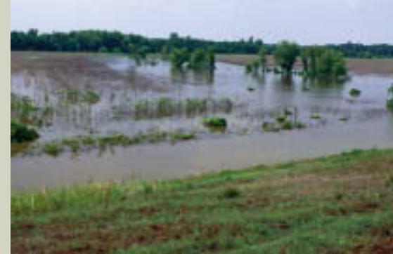
Panther Swamp NWR is part of the newly named Theodore Roosevelt National Wildlife Refuge Complex, MS.

Additionally, planning is underway to swap scattered FmHA tracts for a contiguous block of land in the vicinity of the 1902 bear hunt. ♦