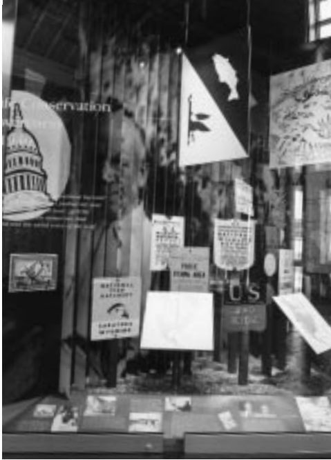
A trip through time. The museum at the National Conservation Training Center features a "conservation time line" with a display of signs that have graced Service facilities over the years and an exhibit on the life and works of Silent Spring author Rachel Carson.

Do you want to know what the Service was like 25, 50 or even 100 years ago? Students and visitors at the National Conservation Training Center in Shepherdstown, West Virginia, can take a self-guided tour through the Service's rich history when they stop by the newly-completed 4,000-square-foot museum in the center's entry and registration building.