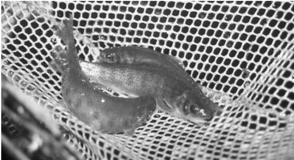
Waiting for release. Jackson NFH in Jackson, Wyoming, raises juvenile Snake River cutthroat trout and releases more than 400,000 of them into their native waters each year.

Forty years after releasing its first fish in 1958, Jackson NFH in Jackson, Wyoming is still going strong. This year the hatchery will raise and release into their native waters more than 400,000 Snake River cutthroat trout.