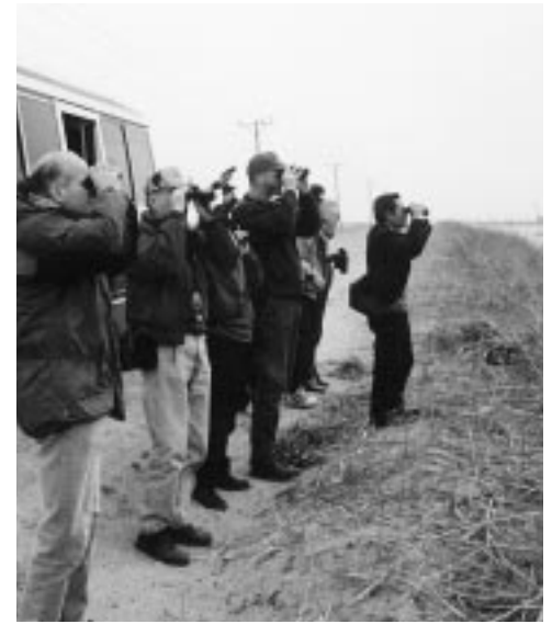
Taking in the scene. Members of the Service's International Conservation Corps and their Chinese counterparts survey coastal marshes near Panjin, Liaoning Province, near the Yellow Sea, where wetlands also contain oil wells and agricultural developments.

The delicate Monarch butterfly overcomes incredible odds on its annual journey from the United States to Mexico and back, providing valuable lessons on migration.