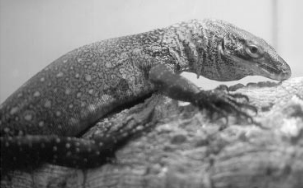
Rare dragon. A juvenile Komodo dragon was among the endangered reptiles smuggled into this country during Operation Chameleon. These lizards, which grow up to 10 feet long, are found only on a handful of islands in Indonesia.

In September, the Office of Law Enforcement closed out the undercover phase of Operation Chameleon, a five-year probe of the illegal international reptile trade. The investigation snared one of the world's best known wildlife dealers and resulted in charges against 20 other individuals in the United States and abroad.