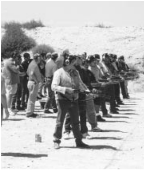
Nature's caretakers. Tribal conservation law enforcement agents practiced shooting under the watchful eye of Service instructors at recent training held in Montana.

It was far from your typical classroom scene—but then this wasn't your typical classroom.