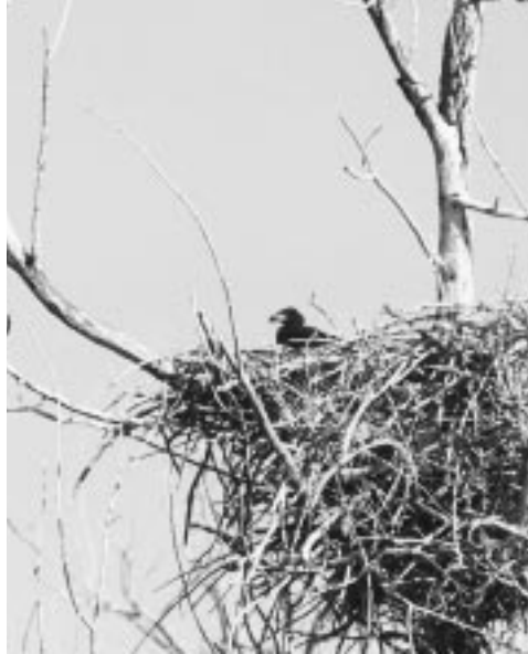
Cause for celebration. This bald eagle chick is the offspring of the first pair of eagles to nest at Devils Lake since 1923.