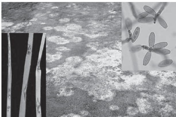
Turfgrass diseases will be examined from three perspectives: symptoms on turf, effects on the plants, and the organisms that cause them. In the background are tell-tale symptoms on creeping bentgrass of snow mold, caused by Typulasp . The insets show lesions associated with Bipolaris leaf spot on tall fescue (left) and spores of one species of Bipolaris that can cause the disease (right).

The new online course is being offered March 3, 2003 through May 2, 2003, and can be taken for one college credit or as professional development with or without CEU credit. Access to the World Wide Web and E-mail is required.