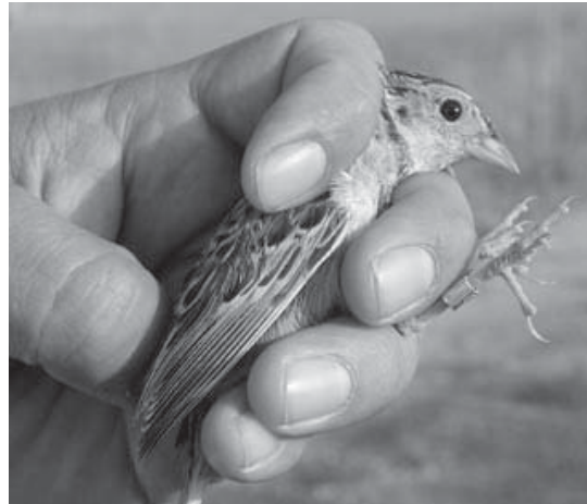
Grasshopper sparrows, which nest in the meadows along the Platte, are being studied as part of the Platte River Trust's research on grassland birds.

Most of Nebraska's grassland breeding birds are migratory, spending as little as four months here before heading south in August and September to winter in the southern US, Mexico, and in some cases South America. The