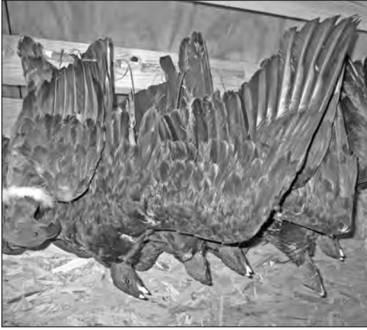
Figure 2. Newly mounted effigies of turkey and black vultures. Note the imitation effigy, extreme left; such imitations are cheap, but less effective and quickly disintegrate.

The carcasses of turkey vultures were given to me free of charge by the Carolina Raptor Center in Charlotte, North Carolina. Raptor or wildlife rehabilitation centers often get vultures that are sick or beyond rehabilitation and have to be destroyed. They were shipped to me frozen solid. I paid a taxidermist to mount the birds at a cost of about $200 each (Figure 2). The effigy heads are made from turkey decoy heads and were painted the proper colors and wired to the body by the taxidermist. Real heads tend to disintegrate and shrivel, while fake decoy heads keep their color and open eyes, thus adding to the overall scaring effect. If the heads come off, the effigies are still effective.