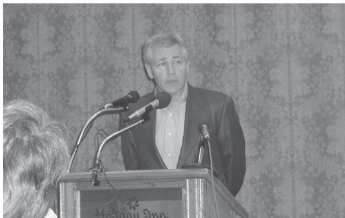
Senator Chuck Hagel kicks off the 2002 Nebraska Grazing Conference by talking about the recently passed Farm Bill and the importance of vital rural economies.

can help make your grazing lands more productive and profitable; controlling cedar trees; how grazing is one of the tools used to manage Spring Creek Prairie to achieve the multiple goals of increasing the diversity of native species and decreasing exotic and invasive species; marketing outlook for cattle; and much more!