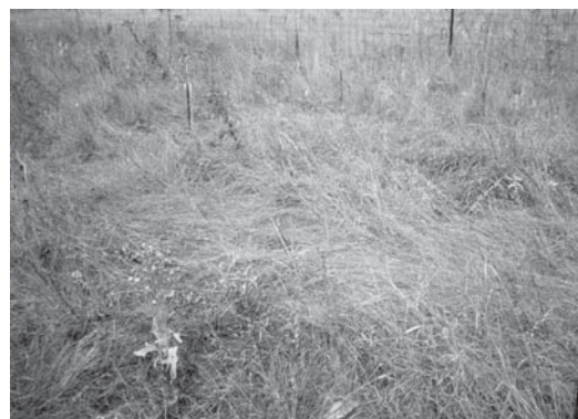
Low species diversity at highest fertilization rate.