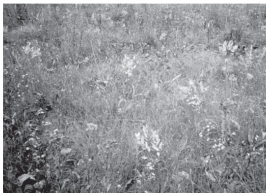
High species diversity when no fertilizer is used.