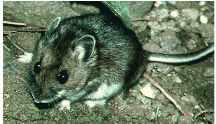
The Deer Mouse

✓Cover or screen all openings in your cabin that are large enough for a rodent to enter. Mice can get into an opening of 1/4 inch or greater.