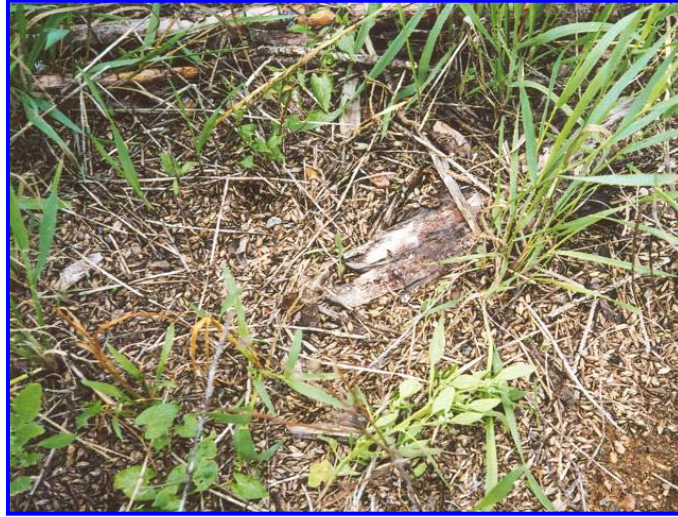
Figure 7. Exotic plant seeds left remaining and germinating at ungulate bait site in Saskatchewan.

Specific examples of effects on community processes include: