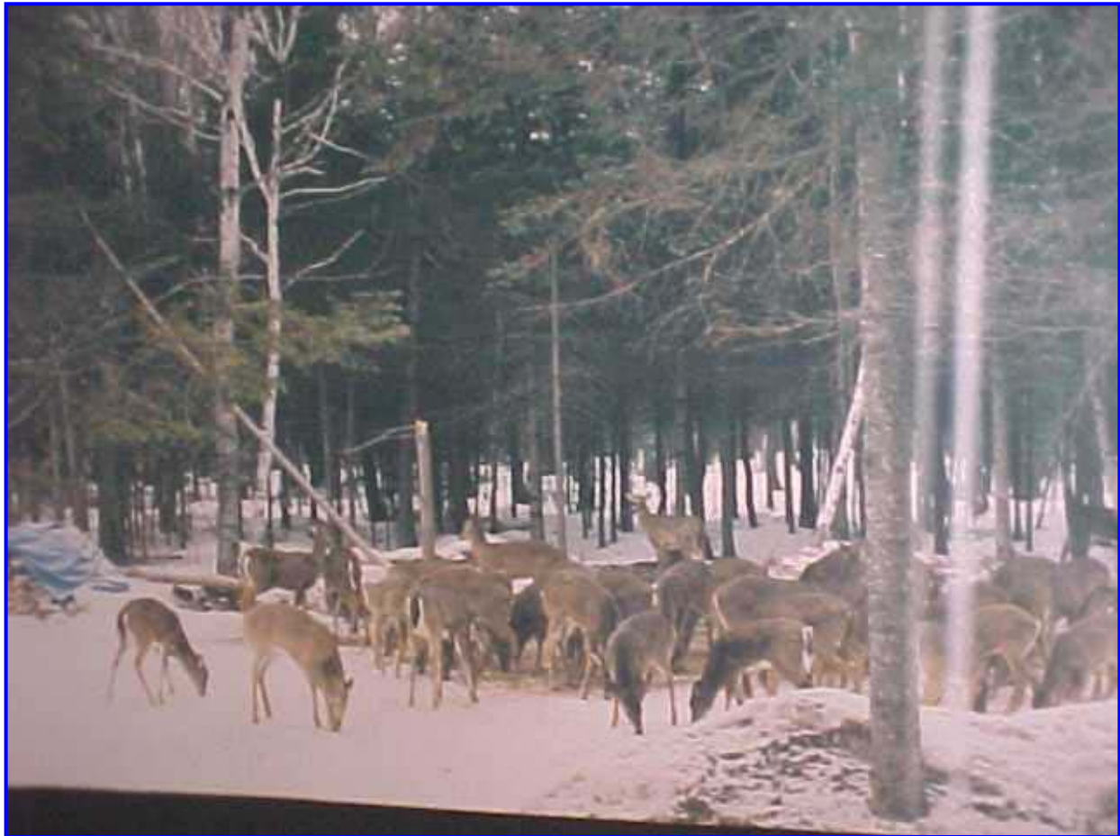
Figure 1. White-tailed deer at winter feeding site in Wisconsin.

It is important to realize that artificial feeding may also occur unintentionally. Garbage dumps, compost heaps, standing agricultural crops, and artificial environments such as golf courses are all potential sources of food used by wild species.