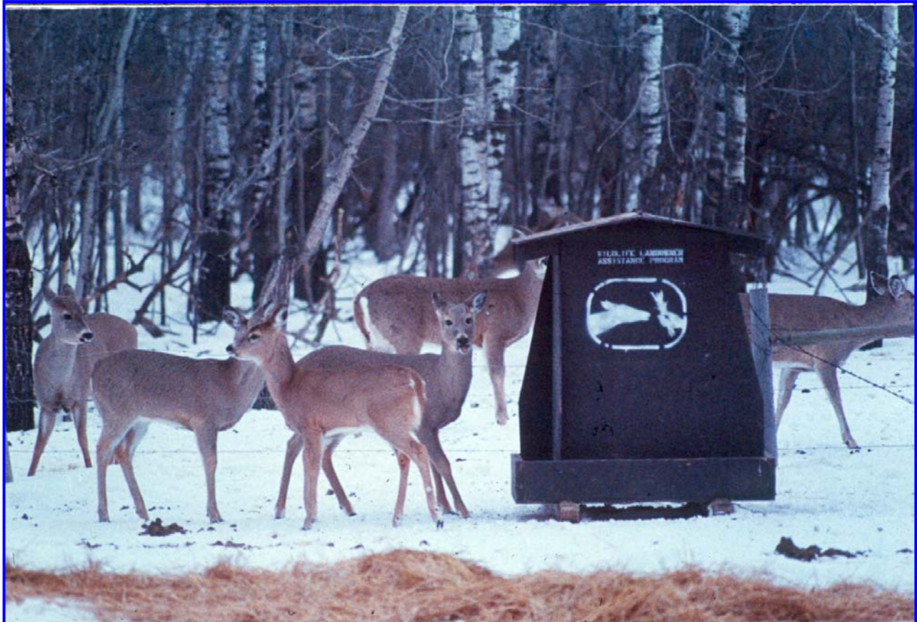
Figure 2. Intercept feeding white-tailed deer as part of the Wildlife Landowner Assistance Program in Saskatchewan.