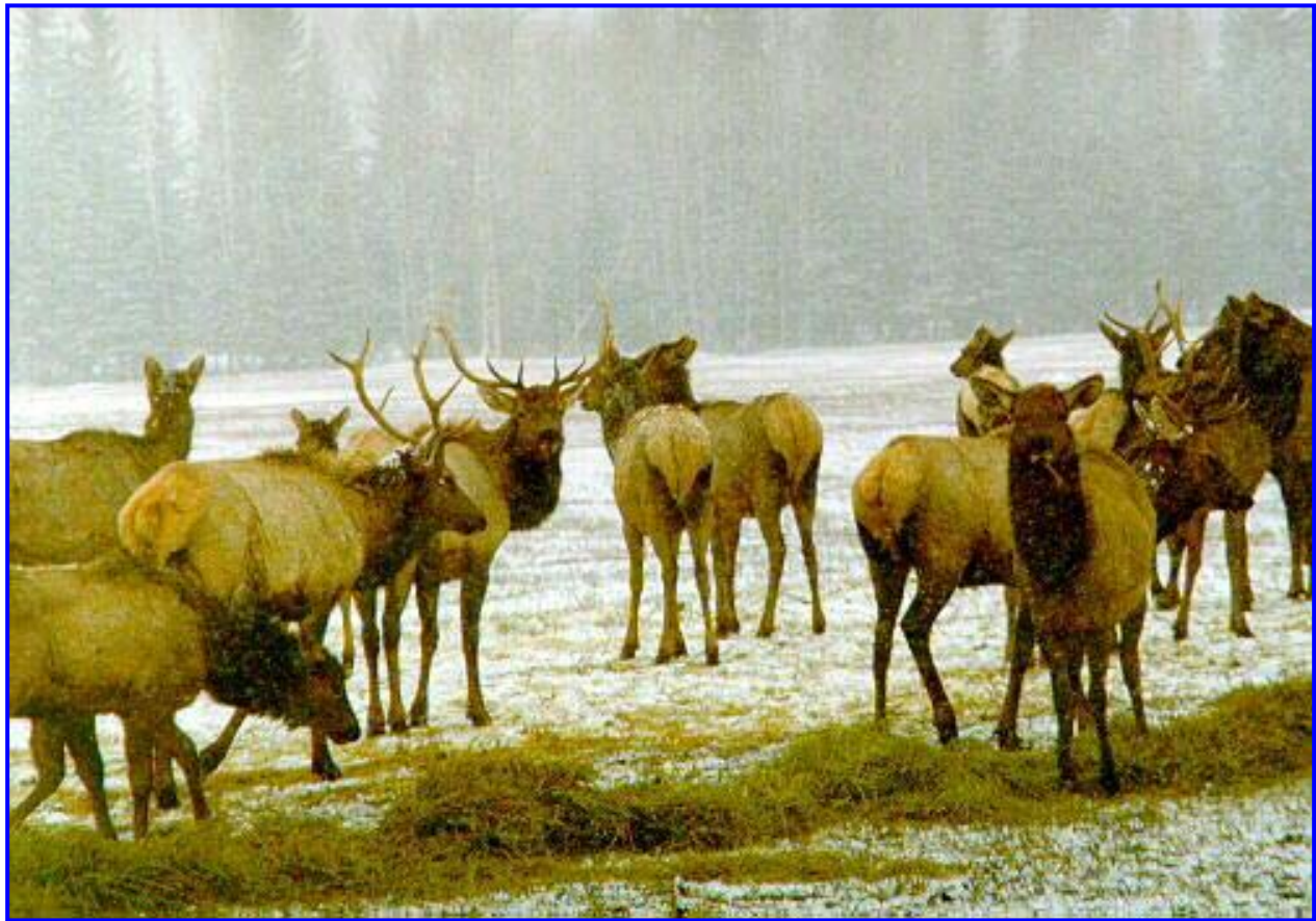
Figure 5. Artificial feeding is used to improve physical condition and reproductive success in a variety of wild species.