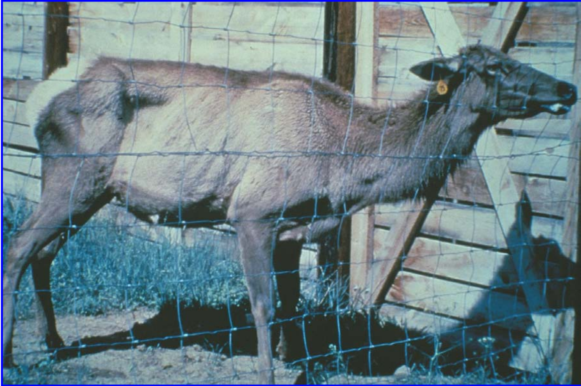
Figure 6. Captive elk infected with chronic wasting disease.

Department of Natural Resources, 2002 – see www.dnr.state.wi.us/org/land/wildlife/regs/02CWDregs.pdf ; New York Department of Environmental Conservation, 2003 – see www.dec.state.ny.us/website/regs/part189.htm ) have recently changed their regulations regarding artificial feeding and baiting in an effort to prevent or reduce infection of wild cervids with CWD.