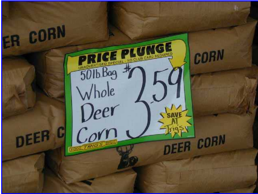
Figure 9. Bagged corn sold for the baiting of white-tailed deer in Wisconsin.

The cost of supplies and services are largely transparent – the manufacturer, distributor, or service sets a price and the consumer knowingly pays it. In contrast, the costs of maintaining artificial feeding programs or dealing with the negative ecological effects of providing food to wildlife (e.g., disease containment, habitat degradation) are often obscure, but generally considerable, long term, and borne by society as a whole. This is illustrated in the following examples: