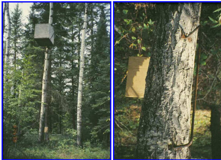
Figure 14. A permanent tree stand in the provincial forest of Saskatchewan.