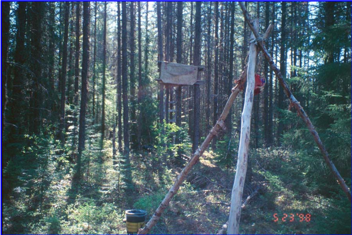
Figure 8. Shooting stand and bait site constructed for hunting black bears in Ontario.

less important to hunters than successfully killing a bear, regardless of its sex or age class.