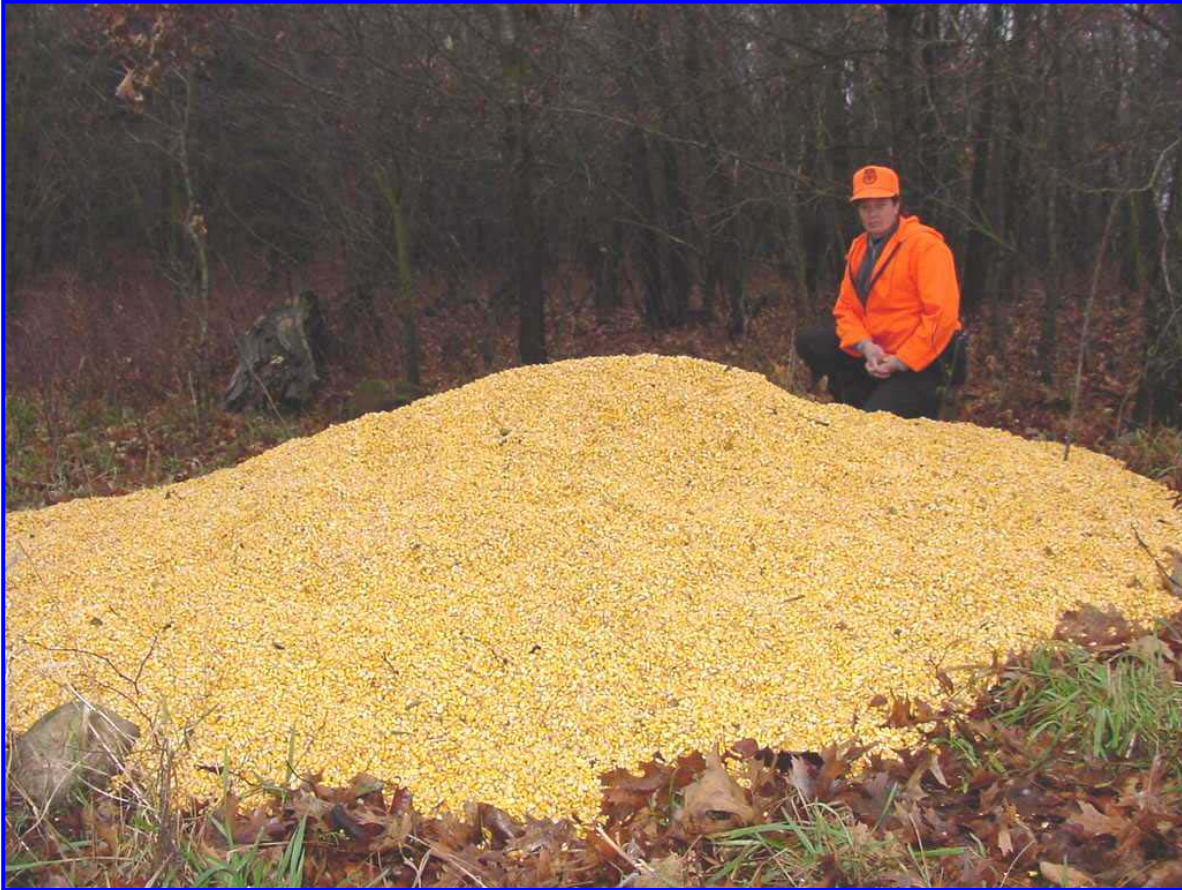
Figure 13. A Wisconsin conservation officer surveys a bait pile that exceeds the legal quantity restriction.