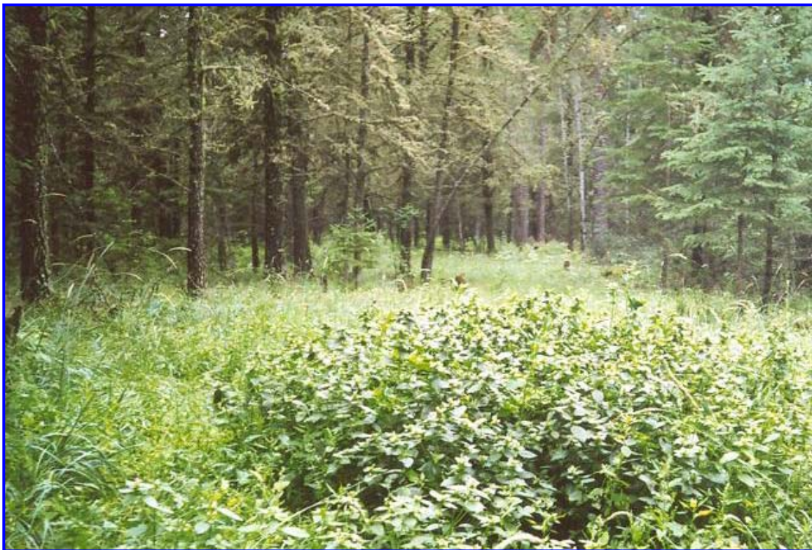
Figure 11. From native forest to introduced plants – exotic plant species thriving along an ungulate shooting lane in Saskatchewan.