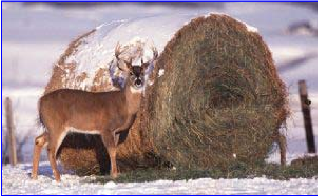
Figure 10. Albeit unintentional, standing agricultural crops, stored hay and grain, and livestock all represent potential sources of food for wildlife.