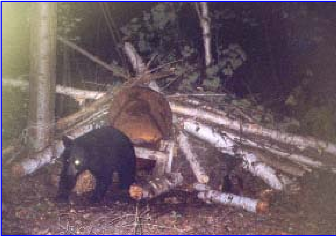
Figure 3. Black bear at bait site used for hunting.