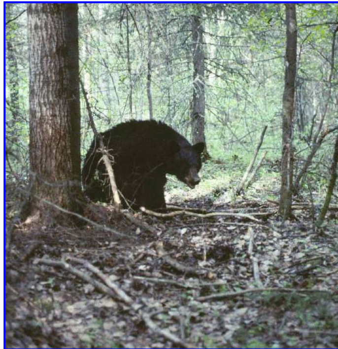
Figure 4. Black bear captured for research by bait and a leg-hold snare.