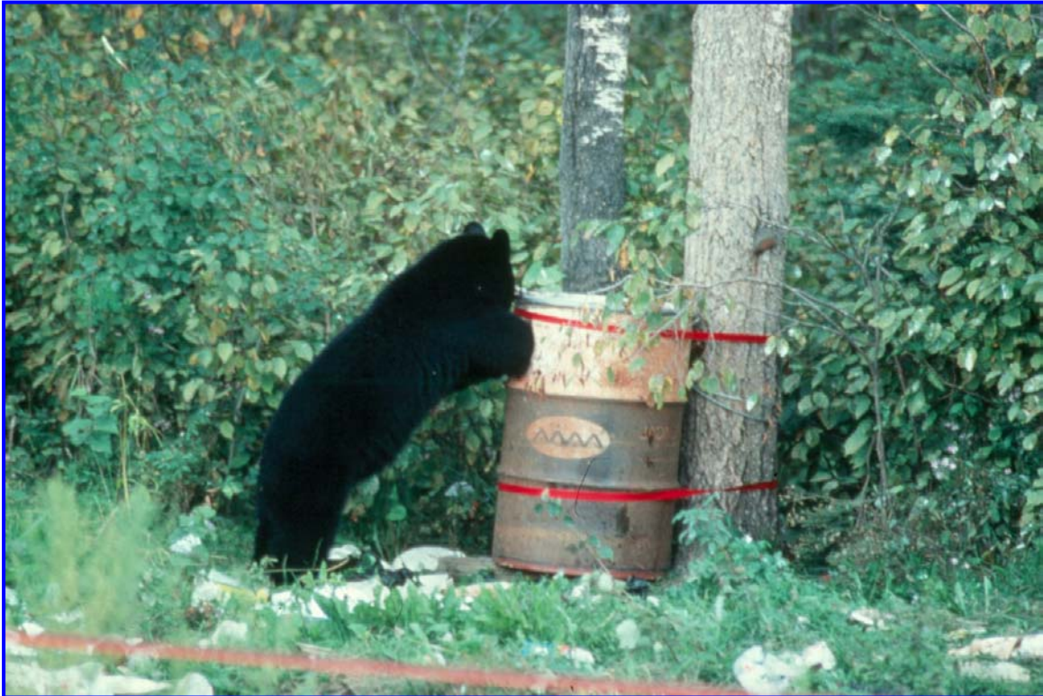
Figure 12. Black bears conditioned to human food sources may lose their natural wariness of people and become aggressive either in protection of, or in seeking other, human food sources.

http://www.serm.gov.sk.ca/media/saskatchewan%20environmentnewsline/reduce_bear_encounter.htm ; Alberta Sustainable Resource Development, 2002 – see http://www3.gov.ab.ca/srd/fw/bears/manage.html ; and Manitoba Conservation, 2002 – see www.gov.mb.ca/natres/wildlife/huntingg/general_information/notice.html ).