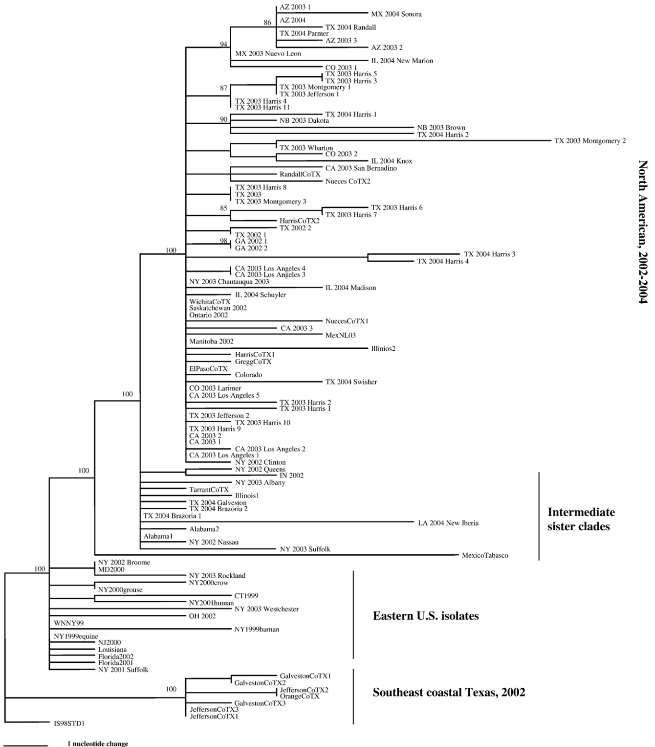
Fig. 1. Phylogenetic tree constructed by Bayesian analysis of prM and E genes (2004 ntds.) of 108 North American WNV isolates.

World strain, Israel-1998. The complete genome analysis generated a tree that also illustrates the presence of the North American 2002–2004 clade, relative to the Eastern U.S. clade and illustrates the presence of more highly resolved subclades within each of the larger clades. As was noted in the prM and E gene tree, the majority of fully