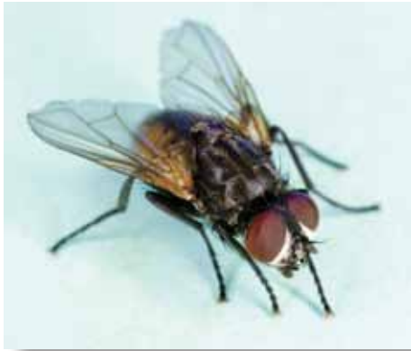
Common house fly, Musca domestica .

The house fly is often considered merely a nuisance. But these flies are capable of transmitting animal and human pathogens that can lead to foodborne diseases, including Escherichia coli , Salmonella , and Shigella bacteria.