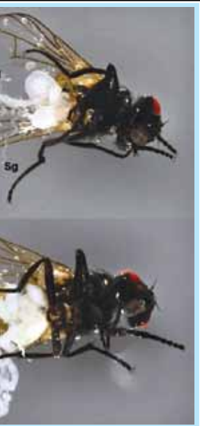
Comparison of a healthy fly (A) and a fly infected with SGHV (B). The fly with SGHV shows underdeveloped ovaries (ov) and overdeveloped salivary glands (sg).

“If we dip the flies in the homogenate or allow them to walk on a surface treated with it, then bingo, we achieve high infection rates; 56 percent of the Danish flies and 50 percent of the Florida flies became