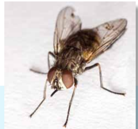
STEPHEN AUSMUS (D2620-17)