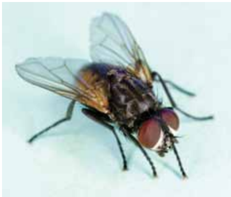
Common house fly, Musca domestica .

The house fly is often considered merely a nuisance. But these flies are capable of transmitting animal and human pathogens that can lead to foodborne diseases, including Escherichia coli , Salmonella , and Shigella bacteria.