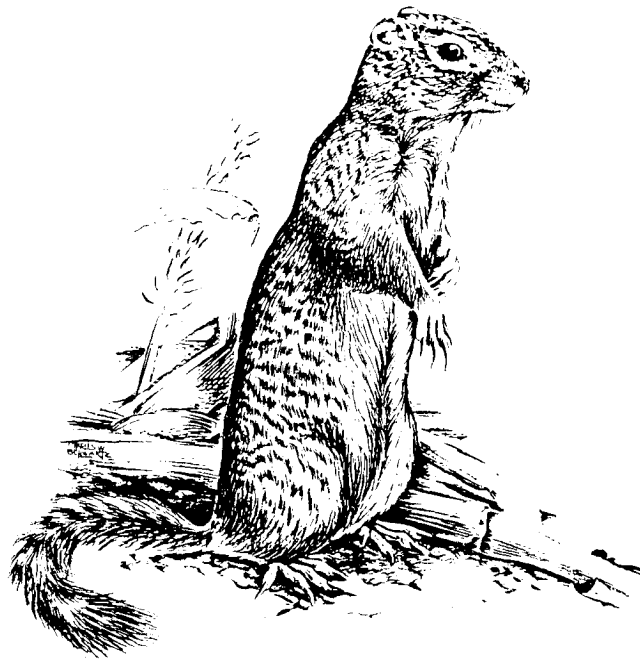
Fig. 1. Franklin ground squirrel, Spermophilus franklinii