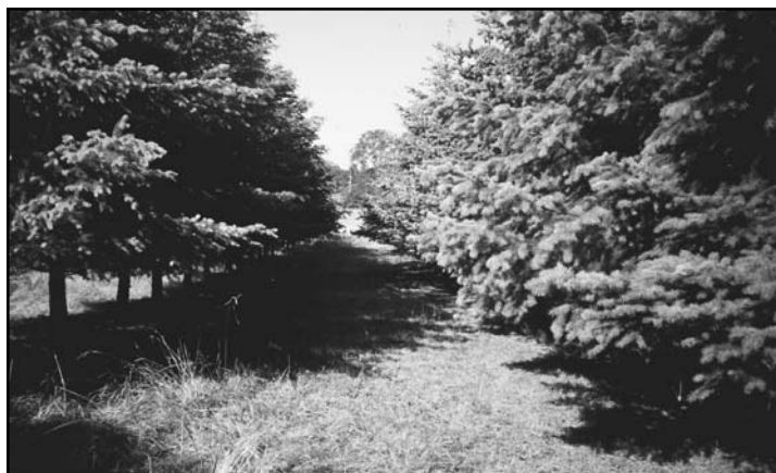
A single row Douglas fir silvopasture system. Pruning allows additional light under the trees and encourages forage production throughout the pasture.

The ability of recently forested land to grow trees can be predicted from performance of the previous stand. However, the ability of pasture or rangeland to support commercial timber production is harder to predict. Many forage plants are more shallowly rooted than are trees, and a very productive pasture may have soils which are too thin or seasonally too wet to support commercial tree production. Since soils can change significantly over very small distances, the presence of the desired tree species near the proposed silvopasture site is no guarantee of successful tree establishment and growth. Local County Extension and the Natural Resources Conservation Service offices are good sources of information about soil suitability for specific pasture and tree species.