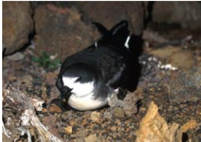
The Hawaiian Petrel, or ‘Ua‘u, has no effective defenses against cats and other non-native predators.

Kaua‘i, Hawaii, Moloka‘i, and Lehua: Approximately 75% of the federally threatened ‘A‘o, or Newell’s Shearwater, nest on Kauai, and indications are that