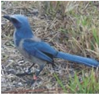
Florida Scrub-Jay.

TNR in Florida: Some counties, such as Palm Beach and Brevard, have amended their ordinances to allow cat colonies if the colony is registered with a design-