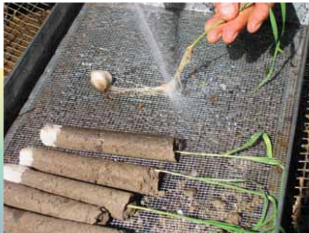
PAT OKUBARA (D2714-1)

In nature, the bacteria and fungi compete for precious space and nutrients that both need to survive and grow. Unlike the fungi, however, these bacteria generally don’t harm the plants and can greatly benefit plants when pathogens are present. It is this phenomenon that the researchers hope to exploit in the form of a bio-based-pesticide seed treatment for wheat and barley and for greenhouse-grown ornamental and herb crops, such as lavender and basil.