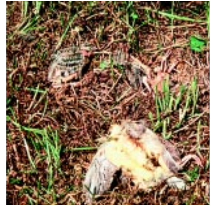
Nest mortality caused by haying (L. Igl)

Although the breeding season is the most critical time of year for most species, birds also need suitable habitat during the migration periods and winter. Few studies have examined bird use of CRP habitats in the Great Plains during those time periods. King and Savidge (1995) reported use in Nebraska by American tree sparrows, ring-necked pheasants, red-winged blackbirds, western meadowlarks, horned larks, and northern bobwhites. Delisle and Savidge (1997) noted only American tree sparrows, ring-necked pheasants, and meadowlarks (eastern and western meadowlarks were not distinguishable) wintering on their Nebraska study areas. For Kansas, Best et al. (1998) indicated that American tree sparrows, ring-necked pheasants, meadowlarks, northern bobwhites, and dark-eyed juncos were fairly common in CRP fields.