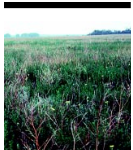
North Dakota CRP (USGS, NPWRC)

Conservation Reserve Program fields clearly are of greater value to breeding birds in the northern Great Plains than are croplands that they replaced. Nonetheless, the continuing loss of native grasslands is a critical concern.