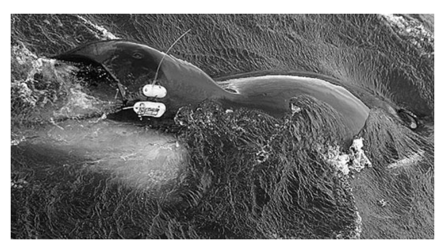
Figure 2. Keiko after arriving in Norway with the VHF tag (on top) and SDR tag (below) mounted to his dorsal fin.

in Norway and a free access enclosure was constructed in Skålvikfjorden, where he remained until his death in December 2003.