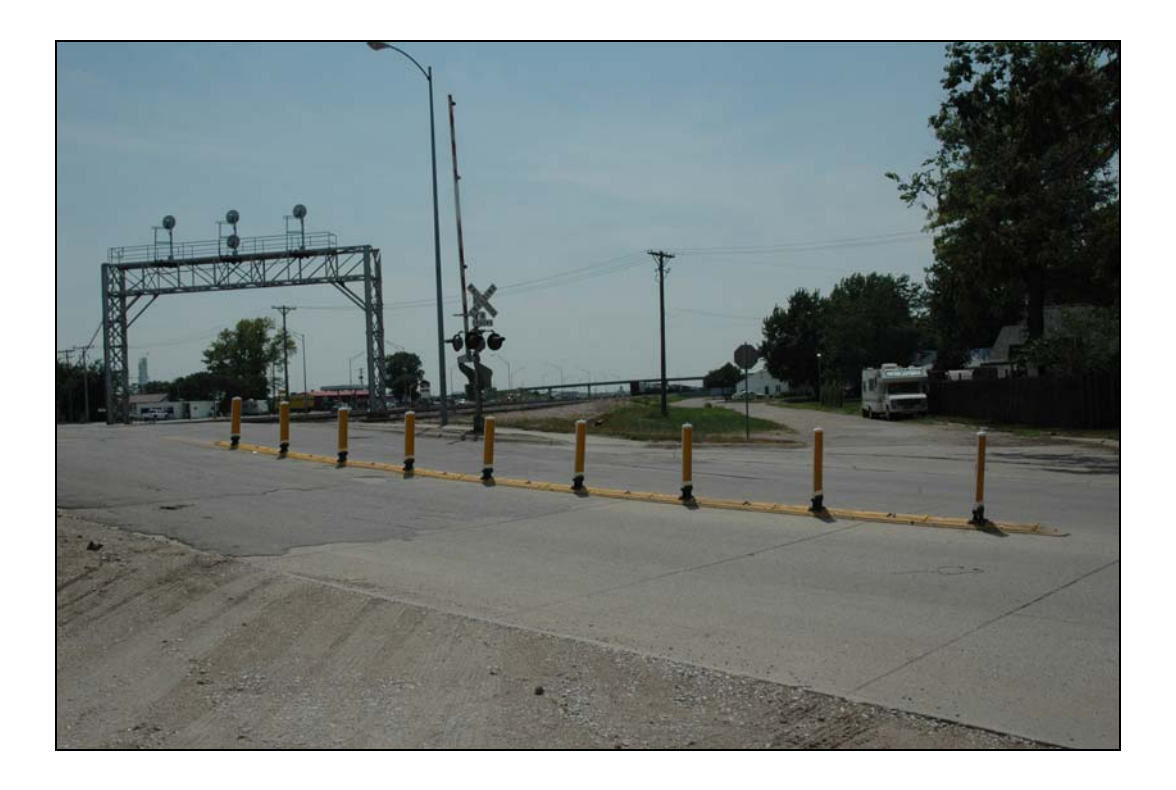
Figure 1.1. Flexible rubber and plastic barrier from Qwick Kurb, Inc.