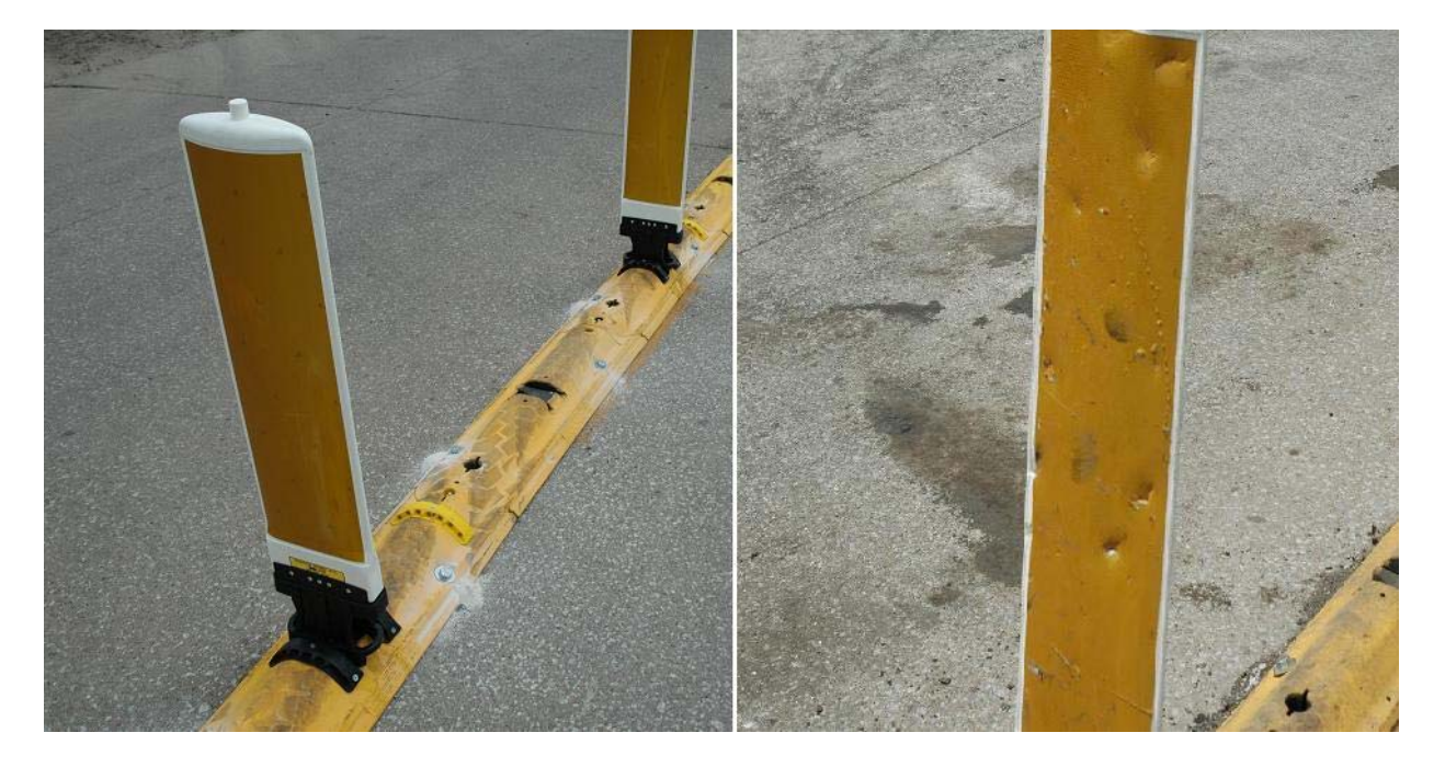
Figure 4.2. Tire tread and scuff marks on curbing installed in Fremont