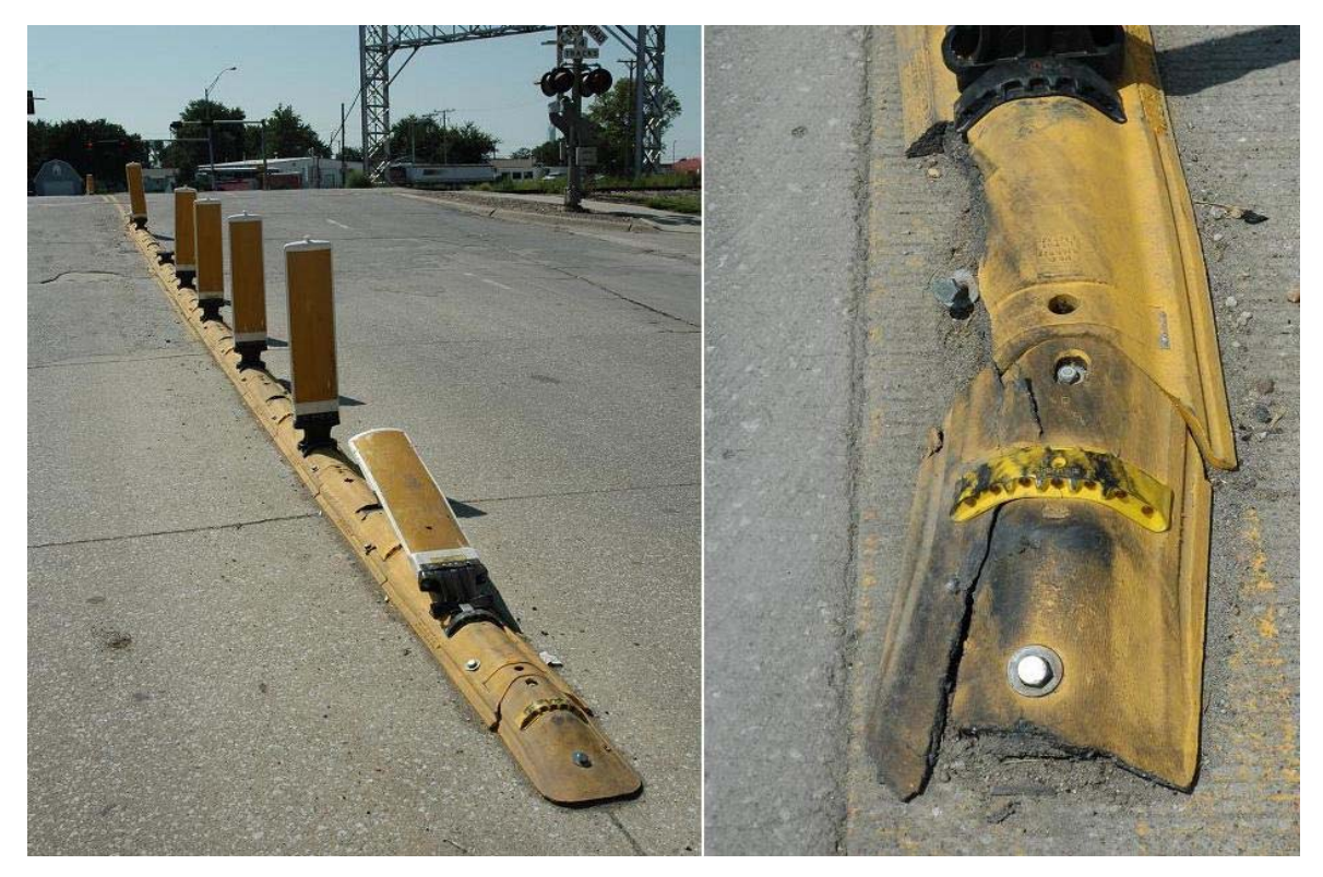
Figure 4.1. Flattened and abused curbing due to overrunning trucks in Waverly