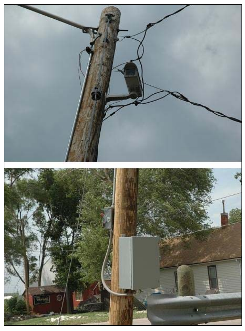
Figure 3.4. Day and night vision camera and DVR storage box mounted on a utility pole in Fremont, NE