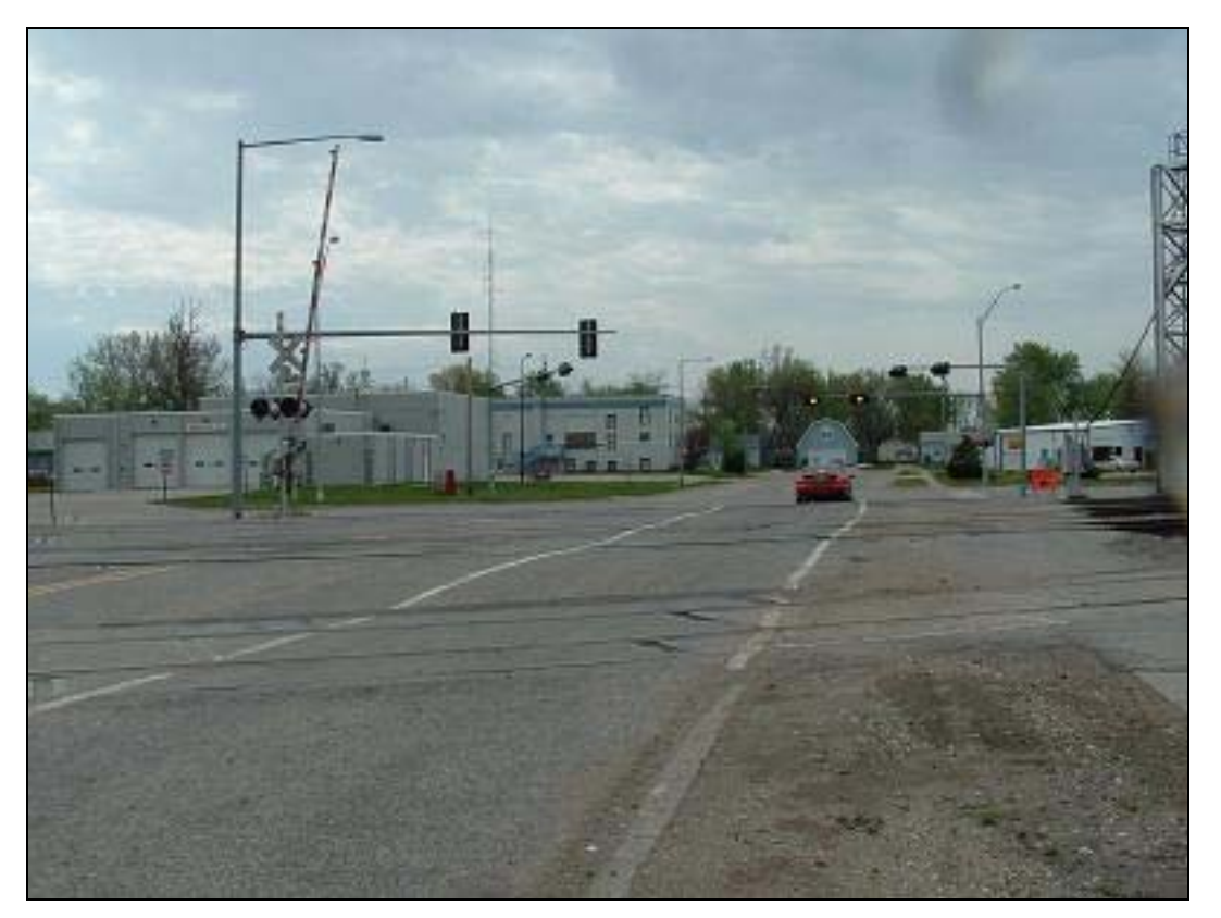
Figure 3.1. Grade crossing at North 141<sup>st</sup> Street in Waverly, NE

The researchers in consultation with the project technical advisory committee (TAC) selected two at grade-crossings for this study based on considerations of: accessibility from Lincoln, NE, adequacy of train and roadway traffic, suitability for video data collection, and cooperation from local administrations. These two locations were North 141<sup>st</sup> Street crossing in Waverly, NE and the crossing at "M" Street in Fremont, NE (figures 3.1 and 3.2, respectively). The Waverly crossing has four sets of railroad tracks crossing the street and is equipped with dual-quadrant gates. The Fremont crossing has two sets of railroad tracks and is also equipped with dual-quadrant gates.