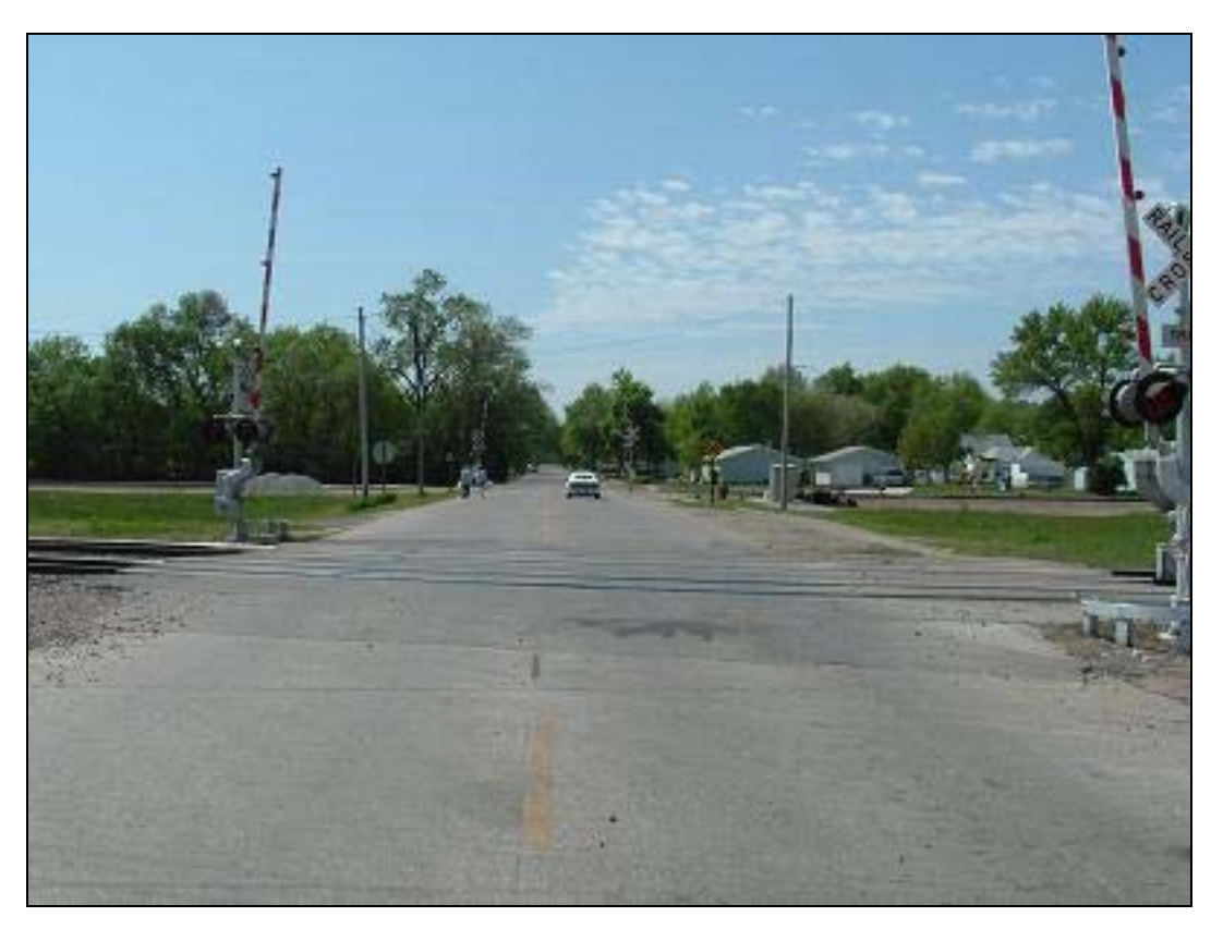
Figure 3.2. Grade crossing at M Street in Fremont, NE