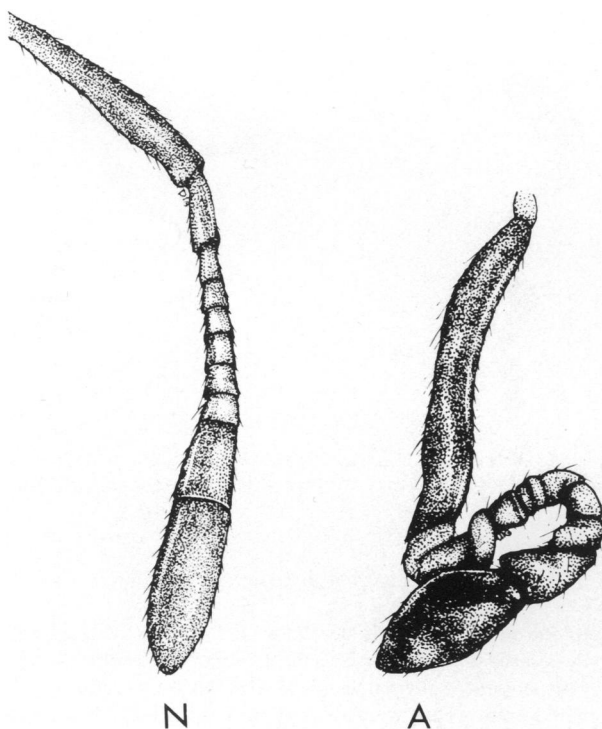
Fig. 2. Drawing of the antennae of an eclosed normal (N) and abnormal (A) worker ant. The abnormal antennae extended straight out from the frons, could not be bent or flexed, and were permanently held parallel to the floor of the nest.

Bioassays were conducted to determine the behavior of the deformed ants toward trails, brood and the queen. A trail was streaked using 0.25 worker equivalents of the hexane extract of the Dufour's gland. The deformed ants were able to move along the trail by pulling themselves along with their spiral tarsi. Contact with the trail pheromone was maintained by the ants bending their heads down to allow the antennal tips to touch the trail. The ants were tested for brood-tending response by allowing them to contact pieces of brood taken from their own nest. The deformed ants did not respond at all to the brood, whereas normal siblings responded in 4 to 6 seconds. When the deformed workers were exposed to their mother queen, they neither groomed nor fed her.