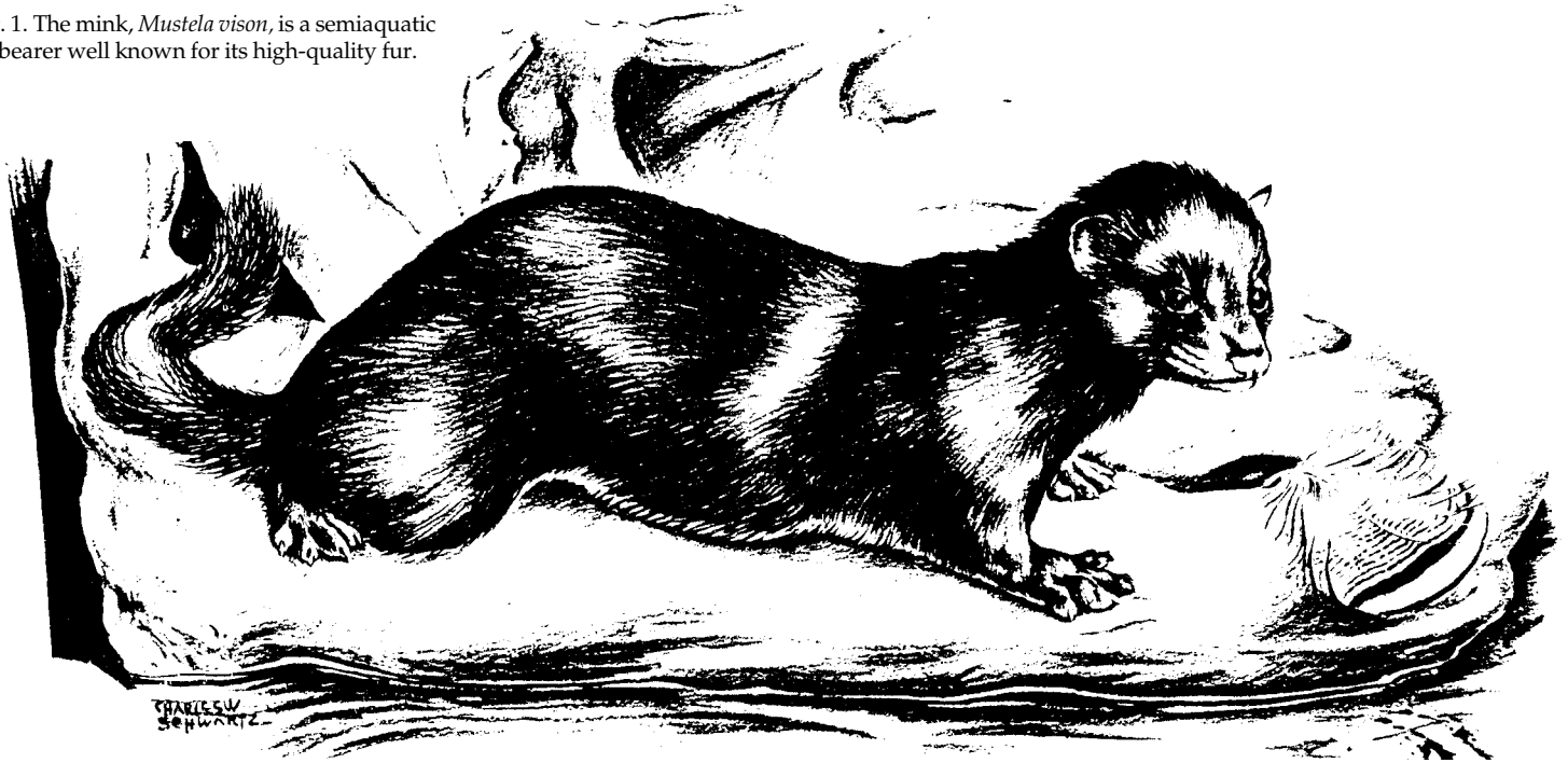
Fig. 1. The mink, Mustela vison , is a semiaquatic furbearer well known for its high-quality fur.