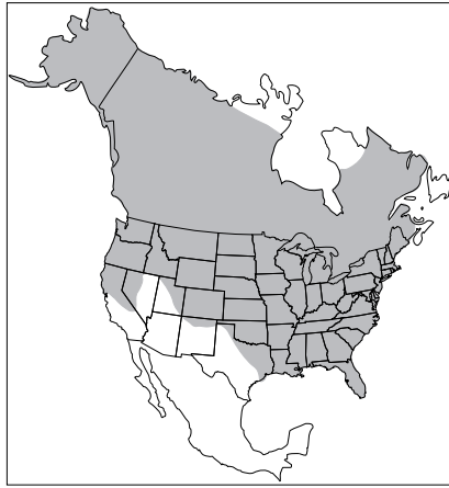
Fig. 2. Distribution of mink in North America.

Mink are polygamous and males may fight ferociously for mates during the breeding season, which occurs from late January to late March. Gestation varies from 40 to 75 days with an average of 51 days. Like most other members of the weasel family, mink exhibit delayed implantation; the embryos do not implant and begin completing their development until approximately 30 days before birth. The single annual litter of about 3 to 6 young is born in late April or early May and their eyes open at about 3 weeks of age. The young are born in a den which may be a bank burrow, a muskrat house, a hole under a log, or a rock crevice. The mink family stays together until late summer when the young disperse. Mink become sexually mature at about 10 months of age.