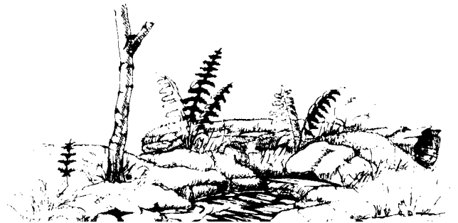
Fig. 4. The spring set catches the mink where a small feeder stream or tile outlet enters a larger stream or impoundment.