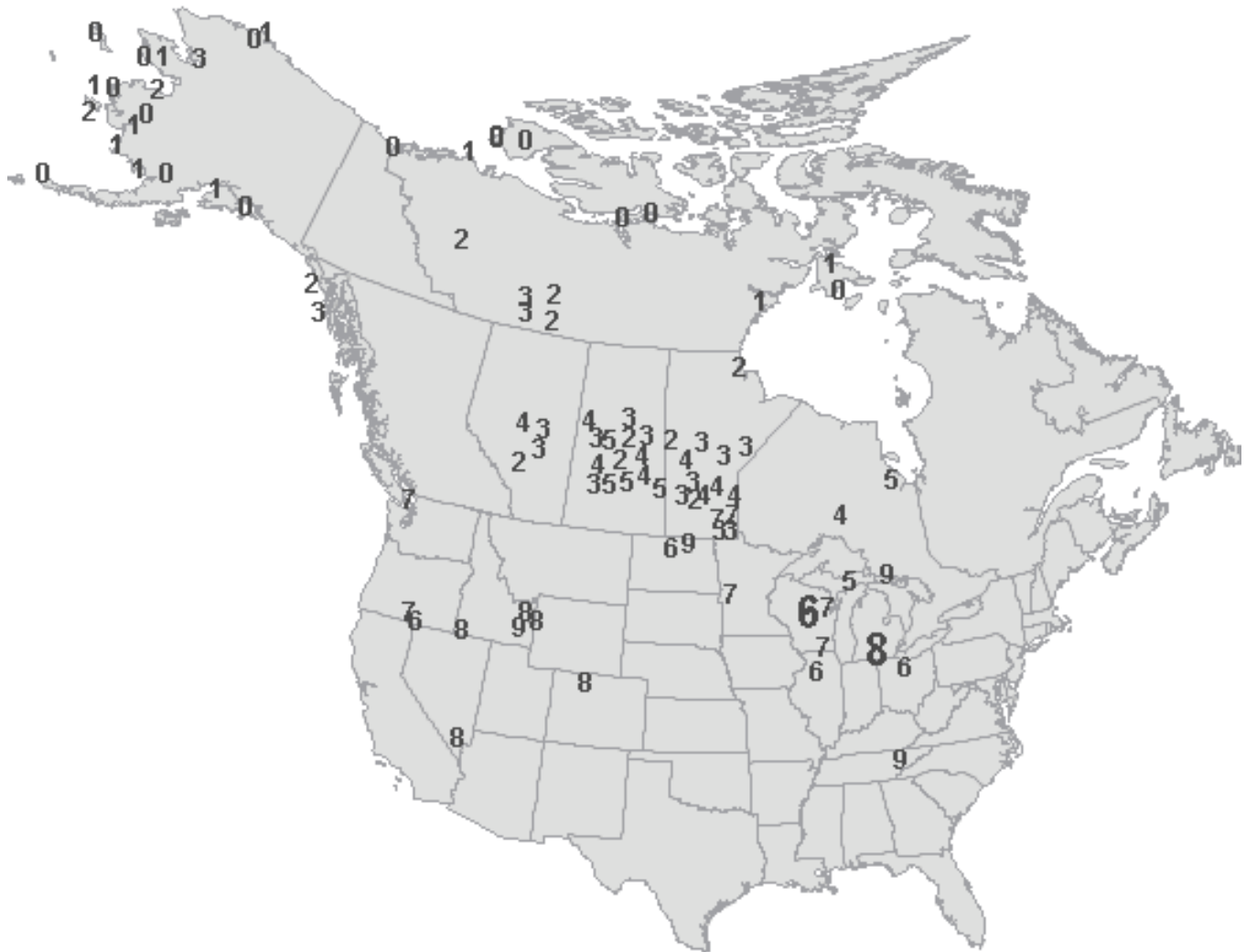
Fig. 2. Deciles (by sex) of the first principal component of sandhill crane morphological measurements, indicating that largest birds typically are found in the 48 contiguous states, smallest birds are in northern Alaska, and birds of intermediate size are found in central Canada. The large numbers indicate median values of large samples of birds from Wisconsin (N = 64) and lower Michigan (N = 17).

0.67 between culmen length and wing chord, and 0.77 between tarsus length and wing chord. The principal component analysis yielded one principal component (PC1) that explained 83% of the variation in the three measurements. It reflected overall body size, with similar coefficients for each measurement: 0.60 for tarsus length, 0.57 for culmen length, and 0.56 for wing chord. When we grouped the PC1 values (by sex) into deciles (e.g., smallest 10%, next-smallest 10%, etc.), we found that larger birds were found mostly in the lower 48 states, smallest birds were in Alaska and the far north, and intermediate-sized birds were mostly in central Canada (Fig. 2).