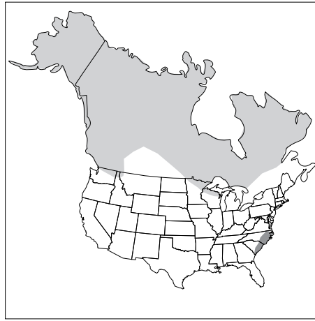
Fig. 2. Current range of the gray wolf (light) and red wolf (dark) in North America.

During the 1800s, gray wolves ranged over the North American continent as far south as central Mexico. They did not inhabit the southeastern states, extreme western California, or far western Mexico (Young and Goldman 1944). In the late 1800s and early 1900s, wolves were eliminated from most regions of the contiguous United States by control programs that incorporated shooting, trapping, and poisoning. Today, an estimated 55,000 gray wolves exist in Canada and 5,900 to 7,200 in Alaska. In the contiguous United States, the distribution of the gray wolf has been reduced to approximately 3% of its original range.