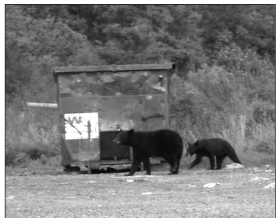
Black bears seek food in a garbage bin.

aversive conditioning, such as lithium chloride, loud noise, pepper spray, rubber buckshot, and dogs have been used on nuisance black bears by state and federal agencies across North America, but limited research has been conducted testing effectiveness of these methods in deterring nuisance bear behavior (Colvin 1976, Hunt 1984, Gillin et al. 1994, Ternent and Garshelis 1999, Beckmann et al. 2004). Louisiana, much like other states, uses aversive conditioning techniques with limited knowledge of the effectiveness on bear behavior following release and conditioning. The intent of on-site release coupled with aversive conditioning of bears