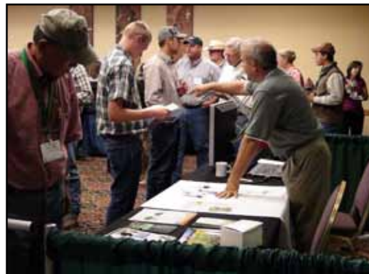
Participants always enjoy the time they have to browse the company and organization exhibits.