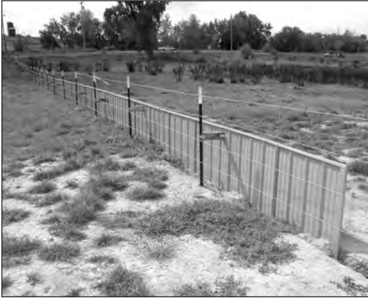
Figure 2. A corrugated steel barrier, partially installed.

was 490 m (SD = 312 m, range = 138–1161 m). The average height was 73 cm (SD = 16 cm, range = 40–95 cm).