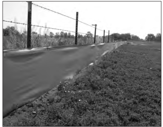
Figure 1. An intact vinyl barrier.

Barriers were evaluated only once. Our criteria of success for an effective barrier was that it must hold up under harsh (particularly windy) weather conditions and must prevent prairie dogs from gaining access to the other side of the barrier. Each barrier was characterized on the basis of its construction materials, height, length, how the barrier was attached to the support structure, and the numbers of active and inactive prairie dog burrows within 10 m of each side of the barrier. We refer to the inside of the barrier as the side with the prairie dog colony, whereas the outside was devoid of prairie dogs when the barrier was constructed. All damaged parts of each barrier were counted and measured, and the suspected or known