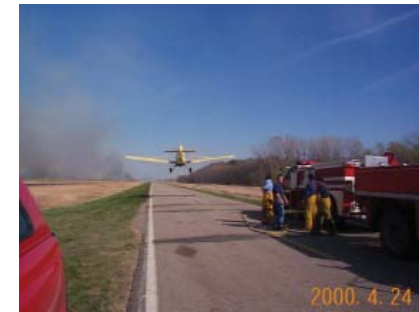
Aerial Wildfire Suppression