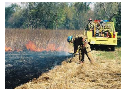
Wildfire Suppression Training

The University of Nebraska-Lincoln does not discriminate based on gender, age, disability, race, color, religion, marital status, veteran's status, national or ethnic origin or sexual orientation.