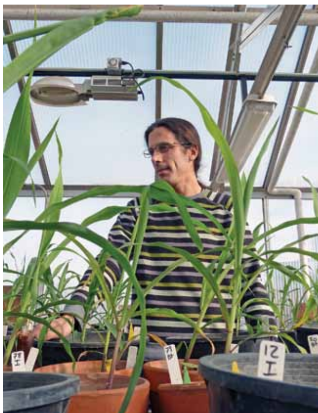
LANILA DEMARTA (D2857-1)