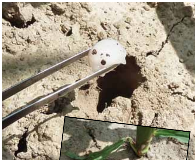
IVAN HILTPOLD (D2859-1)

Visiting scientist Ivan Hiltbold examines corn plants for damage from western corn rootworm in a greenhouse at ARS’s Plant Genetics Research Unit in Columbia, Missouri.