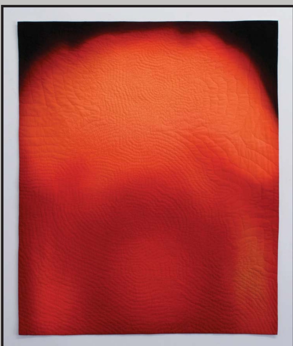
Bacchus's aura, after Caravaggio 2009, hand-dyed, hand-stitched cotton, 39 3/4" x 33"