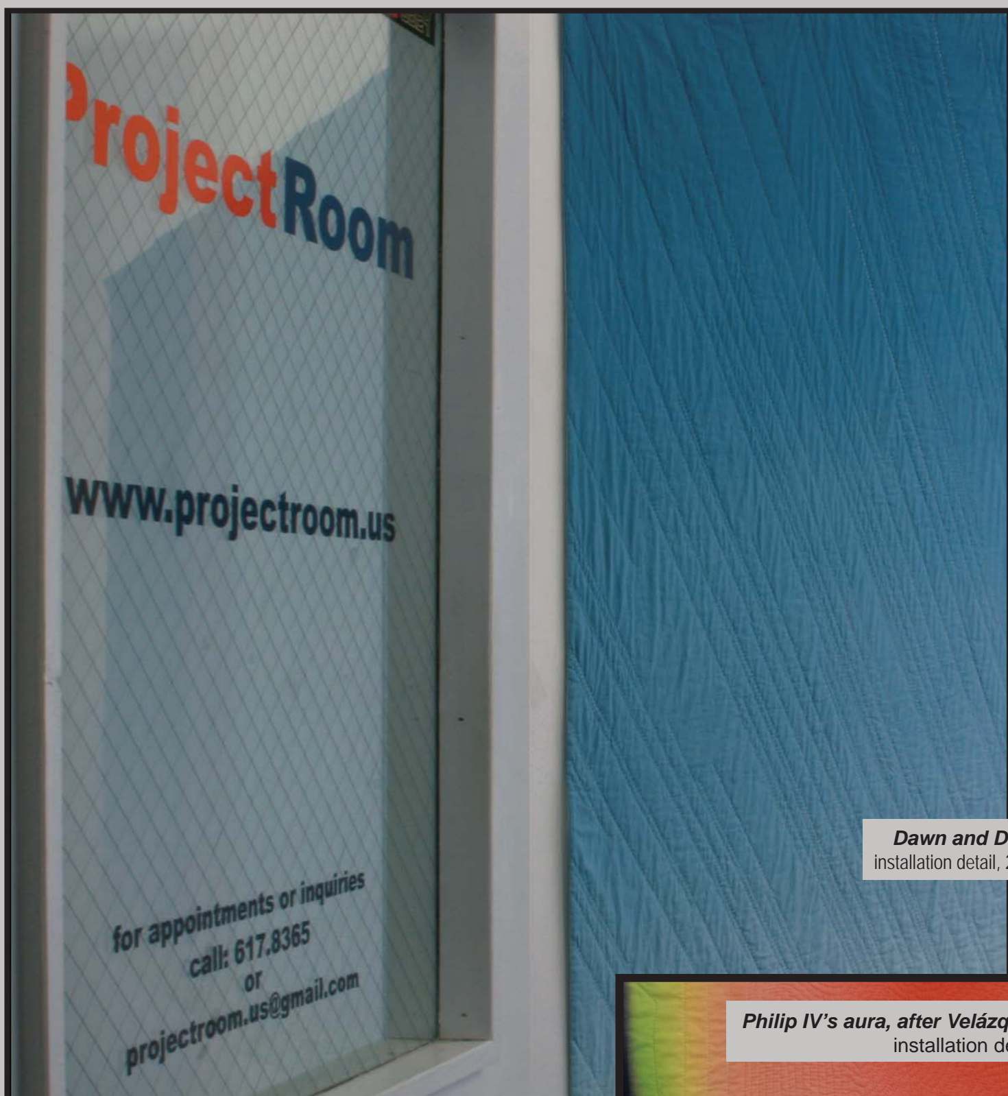
Dawn and Dusk installation detail, 2010

The Project Room 1410 O Street, Lincoln, NE, 68508 (402) 617-8365