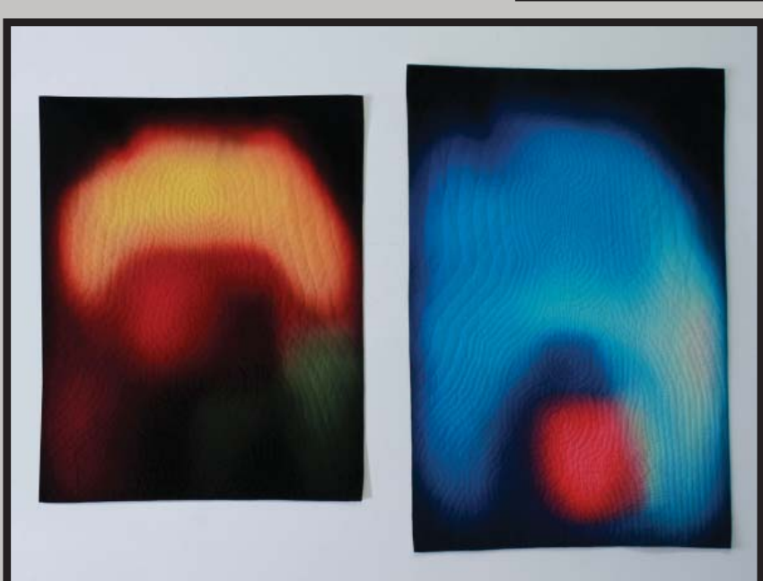
left, Philip IV of Spain's aura, after Velázquez 2009, hand-dyed, hand-stitched cotton, 24 3/4" x 20 3/4"