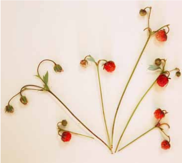
The Cascade strawberry ( Fragaria cascadensis ). The length of the flower stalk for this species is variable. These stalks were collected near Waldo Lake, Oregon.

The strawberry's distribution in the Oregon Cascades stretches from the Columbia River in the north to the vicinity of Crater Lake in the south, at elevations of about 3,000 feet up to tree line. It grows in sandy-clay loam soil of volcanic origin located in forest clearings and open alpine meadows. The northern distribution range of F. cascadensis has an average annual precipitation of 12-15 inches, but the southern range receives only about 6 inches of precipitation annually.