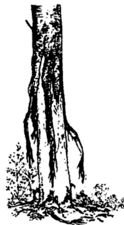
Figure 1. Bear feeding in the spring.

density, site factors, slope, aspect, elevation, habitat quality and the time of the year. Young conifer stands may increase the biotope capacity for bears.