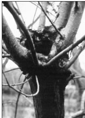
Topping trees results in large areas of decay and fast-growing, weak, and unattractive watersprouts.