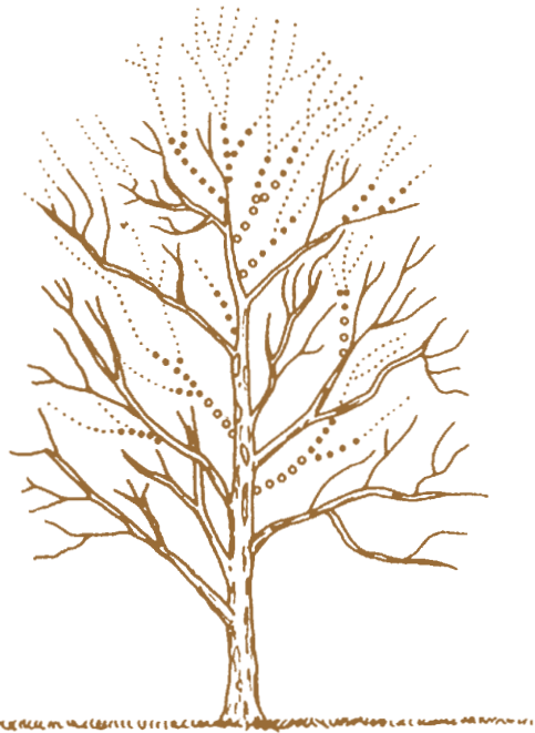
When required because of obstructions, a tree's height should be reduced using thinning cuts.

Thanks to the and the National Arbor Day Foundation for information and illustrations used in this fact sheet.