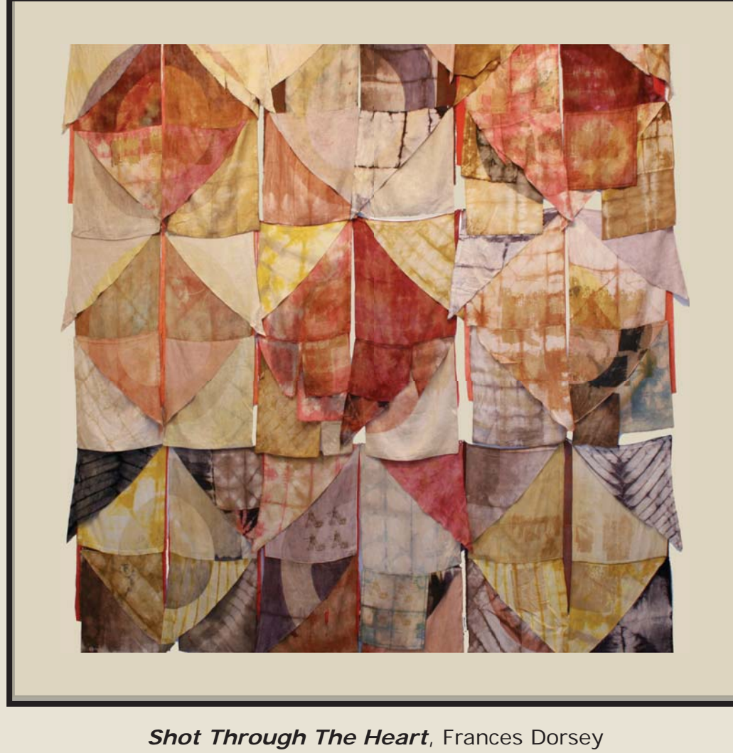
Shot Through The Heart , Frances Dorsey 2010, used linen napkins, tablecloths, natural dyes and extracts; printed and discharged; 132" x 132"