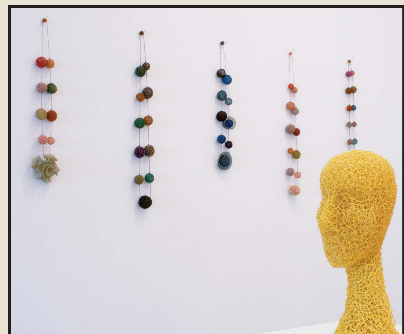
Necklaces and Transition , Soonran Youn