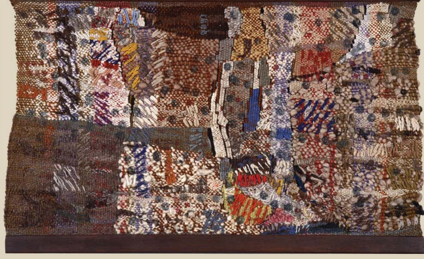
Color it Twill , Lillian Elliot, 1973

Tugboat Gallery www.tugboatgallery.com (402) 477-6200