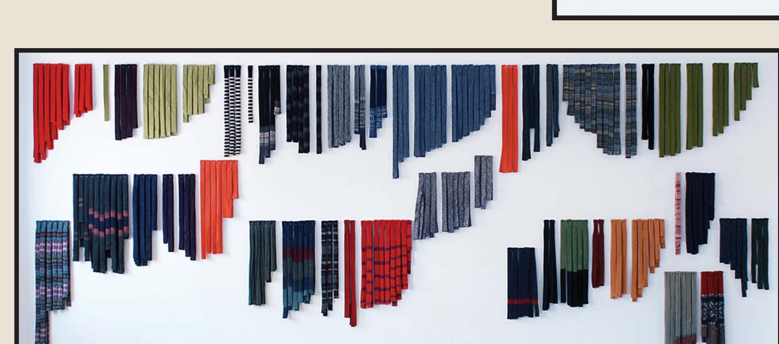
Inventory , Marcie Miller Gross 2008, used felted wool sweater parts, seams, pins