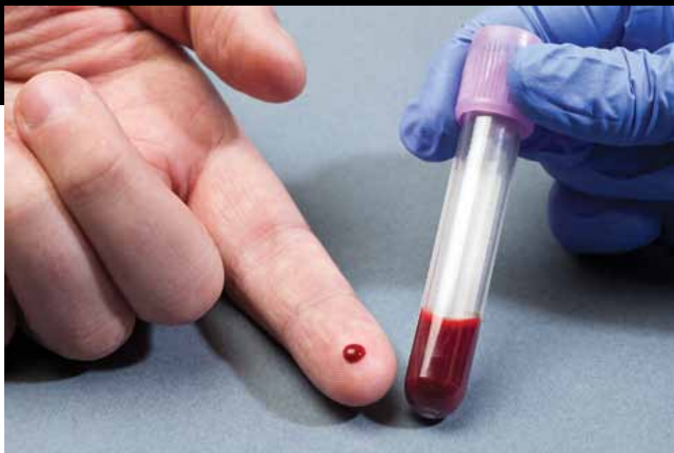
A new vitamin B12 assay developed by ARS scientists at the Western Human Nutrition Center, Davis, California, requires only a tiny drop of blood rather than a standard 1-milliliter sample (right).

In the United States, the very young and the elderly are among the groups at risk of