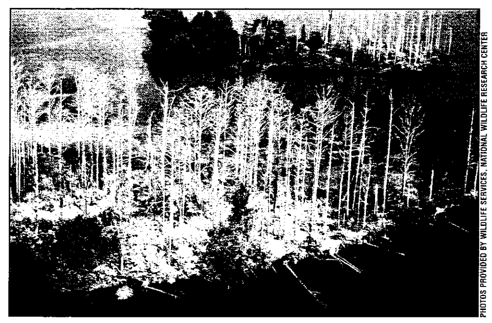
Whether the colony is in trees or on the ground, the effects of so many birds building nests and depositing tons of feces can be catastrophic to sensitive vegetation and other birds using the same habitats.

Cormorants are a migratory species with their core nesting area in the midwestern United States and Central Canada. Most of the cormorants seen in Alabama are wintering or migrating through the state from October through April. Estimates of cormorant abundance from the National Audubon Society's Annual Christmas Bird Counts demonstrate that cormorant abundance has increased steadily since 1970, and cormorant winter abundance indices are at their highest during the past 2 years. We now have major cormorant winter roosts on most of our major reservoirs. As with other areas, double-crested cormorants also have expanded their breeding range in Alabama and are known to