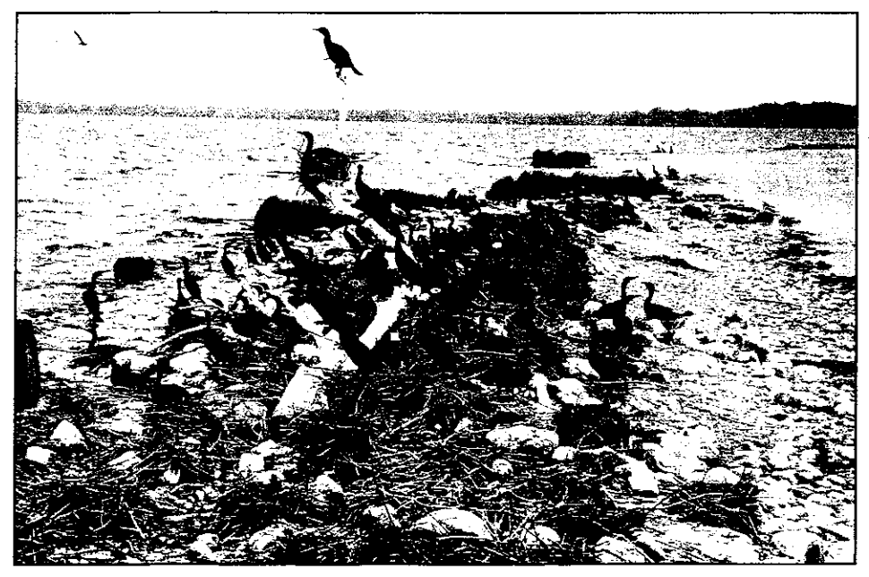
Cormorant nests can be found both on the ground and in trees; however, most nests are found in trees on Guntersville Lake.

Double-crested cormorants are a wildlife management success story. In half a century, this adaptable species was recovered from perilously low population levels to the point of overabundance. Biologists, farmers, and sportsmen are beginning to understand the ecological role of cormorants in the aguatic ecosystems of the state. They are also learning the economic conseguences to Alabama's vital agricultural and natural resources that result from the growing presence of these birds. In the coming years, wildlife managers will have to apply the same management skills that successfully recovered this and other species to find solutions to the conflicts that arise with increasing populations of double-crested cormorants.