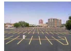
UNOPA parking lot before game day.

Please Make A Greater Individual Commitment!