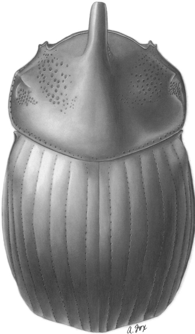
Fig. 1. Copris maesi , dorsal habitus.

4.5 mm long, gradually tapering to narrow blunt apex (apex weakly worn), venter longitudinally and shallowly sulcate and roughened. Lateral margins narrowly reflexed. Elytra : Each stria with row of small punctures, punctures 2–3 diameters apart and joined by narrow, impressed line. Intervals weakly convex with surface similarly crazed and with micropunctures as on pronotum. Eighth stria obsolete in apical half. Pygidium : Surface across base and in an-