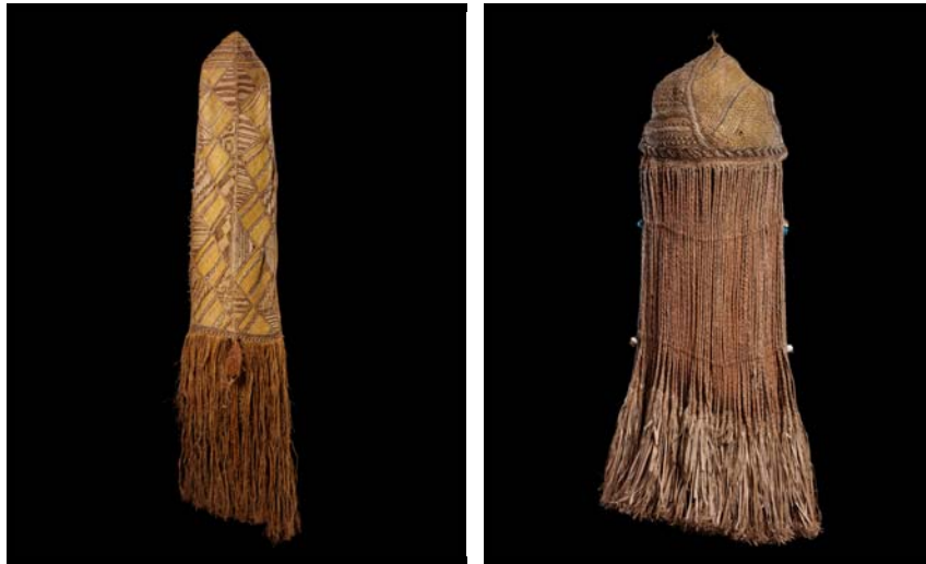
Figure 6 (left). Woman's mourning hood ( kabu ), 19 th –early 20 th century New Guinea, West Papua, Marind-anim people, Yei-nam, Jee-anim sub-group. Jolika Collection of New Guinea Art, Fine Arts Museums of San Francisco, 2007.44.42.

For the Marind-Anim of West Papua, women play an important role in the funerary rites. In what can be seen as the completion of the life cycles, women as the bringer of life are also responsible for caring for and mourning the dead. Women commemorate the dead in their own ceremony makan hawn , which translates to seeing the earth or seeing the places the deceased use to visit. This intricately plaited head covering would be worn by a close female relative, commonly the widower or sister of the deceased, during the woman's mourning procession.