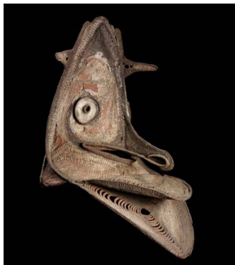
Figure 8. Female Mask, 20 th century East Sepik Province, middle Sepik River, between Karawari (Korewori) and Blackwater rivers, Kapriman village area, Kapriman language speakers. Jolika Collection of New Guinea Art, Fine Arts Museums of San Francisco, 2007.44.57.

A tradition of masterful basketry techniques are recorded in this region of the great Sepik River including coiling used to create very large gable masks for the front of men's ceremonial houses and these elaborate helmet masks. Bundles of split cane have been coiled to create the three-dimensional elements such as the lower jaw. This female mask in the Jolika Collection was collected with its male counterpart. They are a very rare pair. We don't have specific information about how the Jolika Collection masks were used in the village where they were created. However, there is documentation of similar masks from the same area used during initiation ceremonies when initiates received their scarification marks. 8