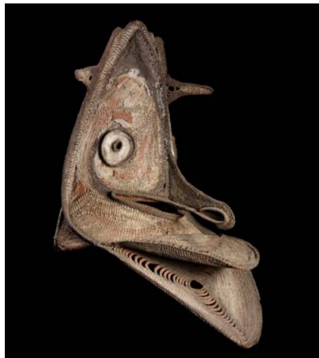
Figure 8. Female Mask, 20 th century East Sepik Province, middle Sepik River, between Karawari (Korewori) and Blackwater rivers, Kapriman village area, Kapriman language speakers. Jolika Collection of New Guinea Art, Fine Arts Museums of San Francisco, 2007.44.57.

A tradition of masterful basketry techniques are recorded in this region of the great Sepik River including coiling used to create very large gable masks for the front of men's ceremonial houses and these elaborate helmet masks. Bundles of split cane have been coiled to create the three-dimensional elements such as the lower jaw. This female mask in the Jolika Collection was collected with its male counterpart. They are a very rare pair. We don't have specific information about how the Jolika Collection masks were used in the village where they were created. However, there is documentation of similar masks from the same area used during initiation ceremonies when initiates received their scarification marks. 8