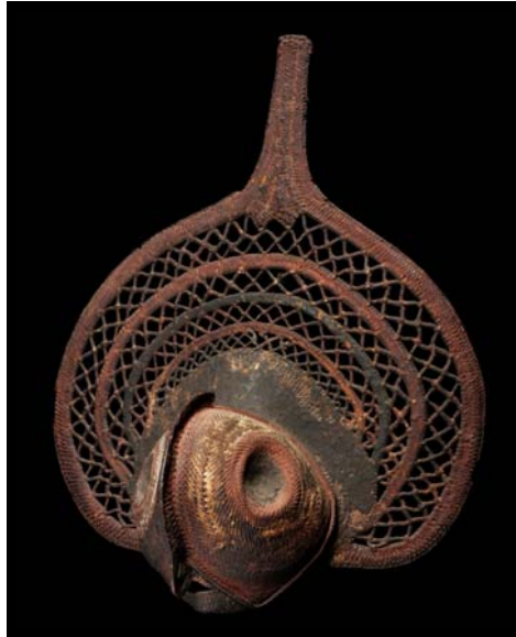
Figure 11. Yam mask, Baba Mini , 20 th century New Guinea, East Sepik Province, Prince Alexander Mountains, Abelam people, Wosera subgroup. Jolika Collection of New Guinea Art, Fine Arts Museums of San Francisco, 2007.44.24.

Further north of the Sawos reside the Abelam people. The Abelam revere yams as a dietary staple and as objects imbued by powerful spirits. 15 This small yam mask, measuring just 27 inches in height, called a baba mini , was probably used to decorate the finest yams in annual exchange ceremonies and competitions celebrating the harvest.