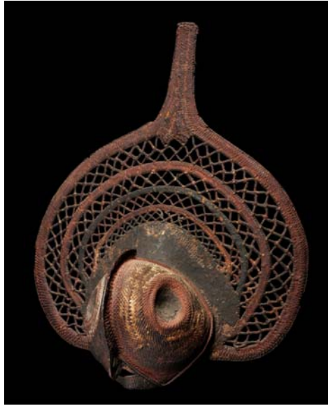
Figure 11. Yam mask, Baba Mini , 20 th century New Guinea, East Sepik Province, Prince Alexander Mountains, Abelam people, Wosera subgroup. Jolika Collection of New Guinea Art, Fine Arts Museums of San Francisco, 2007.44.24.

Further north of the Sawos reside the Abelam people. The Abelam revere yams as a dietary staple and as objects imbued by powerful spirits. 15 This small yam mask, measuring just 27 inches in height, called a baba mini , was probably used to decorate the finest yams in annual exchange ceremonies and competitions celebrating the harvest.