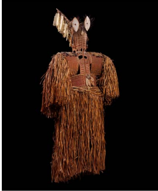
Figure 5. Spirit mask costume ( doroe, dekewar ) for jipae festival, 20 th century New Guinea, West Papua, Asmat people. Jolika Collection of New Guinea Art, Fine Arts Museums of San Francisco, 2007.44.17.

The Asmat believe that the dead do not immediately leave the earth and while they linger there is the potential for danger. 5 The jipae ceremony takes place every few years to commemorate important people who have passed away since the last ceremony and to rid their spirits. The creation of the spirit mask is surrounded with as much ritual as the ceremony itself. The process begins with strips of mulberry being collected and brought into the confines of the men's house. A member of the yeu (initiated male) community twists the mulberry into a fine cord and presents it to the mask's sponsor. The mid-section and shoulders are then constructed of the rattan in a single-rod coiled basketry technique. The mulberry cord is attached to the rattan waistband and the mask is gradually built up- using a delicate single-element looping technique to complete the chest and headpiece. The mask is painted with red ochre and lime and important appendages are added including the wooden eye lozenges and the feathered stick protruding from the back of the head. The palm leaf skirt is not added until needed for ceremony. The construction of the mask can take four to five months-during which time the makers are supported by the mask wearer.