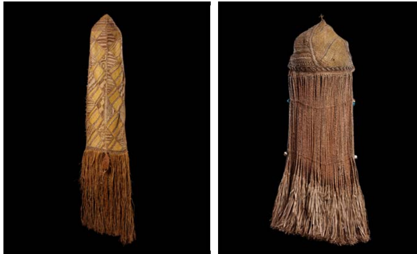
Figure 6 (left). Woman's mourning hood ( kabu ), 19 th –early 20 th century New Guinea, West Papua, Marind-anim people, Yei-nam, Jee-anim sub-group. Jolika Collection of New Guinea Art, Fine Arts Museums of San Francisco, 2007.44.42.

For the Marind-Anim of West Papua, women play an important role in the funerary rites. In what can be seen as the completion of the life cycles, women as the bringer of life are also responsible for caring for and mourning the dead. Women commemorate the dead in their own ceremony makan hawn , which translates to seeing the earth or seeing the places the deceased use to visit. This intricately plaited head covering would be worn by a close female relative, commonly the widower or sister of the deceased, during the woman's mourning procession.