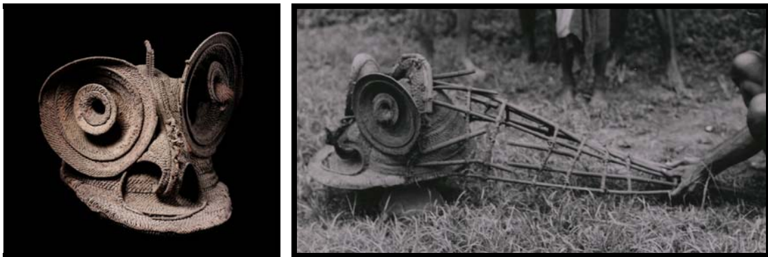
Figure 9 (left). Mask, mivai , 20 th century East Sepik Province, middle Sepik River, Sawos people. Jolika Collection of New Guinea Art, Fine Arts Museums of San Francisco, 2007.44.104.

We can see similarities in technique and materials when we look at another mask also from the East Sepik region—from an area north of the Sepik River. This rare mask from the Sawos people has been built of numerous individual coiled basketry units combined together into an elaborate helmet shape.