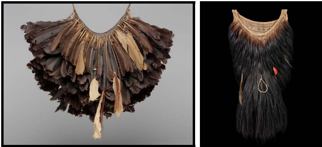
Figure 1 (left). String bag ( kabeel men ), 20 th century New Guinea. Figure 2 (right). String bag ( tiyaapl men ), mid-20 th century New Guinea. Both Figures: Upper Sepik River, Mountain Ok people. Jolika Collection of New Guinea Art, Fine Arts Museums of San Francisco, (left - 2007.44.79) (right - 2007.44.135).

For the Mountain Ok people, the string bag, embellished with bird feathers is a signifier of male initiation. This kabeel men adorned with the feathers of the hornbill bird marks the third phase of initiation for a young man.