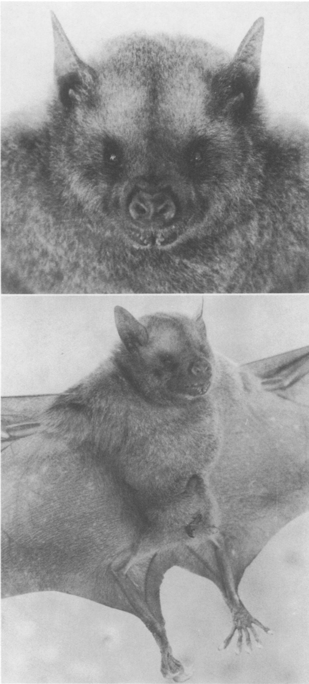
FIGURE 2. Male Brachyphylla cavernarum cavernarum photographed on Guadeloupe Island by Robert J. Baker.

all the subspecies. The nominate subspecies, Brachyphylla cavernarum cavernarum , includes the largest individuals, and occurs on St. Croix in the Virgin Islands and Anguilla southward through the Lesser Antilles to St. Vincent. The third subspecies, Brachyphylla cavernarum intermedia , is intermediate in size and occurs on Puerto Rico and most of the Virgin Islands (St. John, Norman, and St. Thomas, excluding St. Croix). This subspecies is not distinguished by any one single character, but its overall size as measured in multivariate analyses indicates that 80% to 90% of the individuals in this population are distinguishable from Lesser Antillean populations.