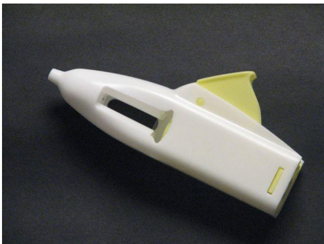
Fig. 1. The Dolphin™ unit-spray device. (Valois of America, Inc.)

The Dolphin™ is a unit-spray device (Fig. 1) designed to deliver 200 µl of product in two, 100 µl sprays. The manufacturer (Valois of America, Inc.) has determined that the mean delivery volume is 200.1 µl with a range of 193.9–207.5 µl. Less than 1% of the spray droplets from each spray are smaller than 10 µm in diameter which reduces the probability of the sprayed product entering the lungs. The average diameter of the droplets is 100.9 \pm 11.5 µm for the first spray and 81.7 \pm 10.4 µm for the second spray. In the Walter Reed Army Institute of Research (WRAIR) laboratory the mean spray volume for saline was 196.9 \pm 4.3 µl and for Invaplex 50 it was 194.9 \pm 10.1 µl. During clinical trials it was not possible to determine the actual volume sprayed but the amount retained in the device was determined for each of the three dose amounts of Invaplex 50 given during the trial (Table 2). Although the retained volume ranged from 19.7 µl to a maximum of 77.1 µl there was no