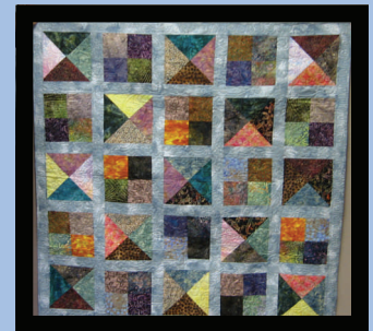
Quilt Drawing to be held at the December General Meeting.

Those PSP deadlines always seem to come up fast. NOW is the time to start if you want to meet the January 15 and May 15 deadlines! And if you earned your PSP five years ago, it's time for you to recertify. Don't be left out, make sure your certification is current.