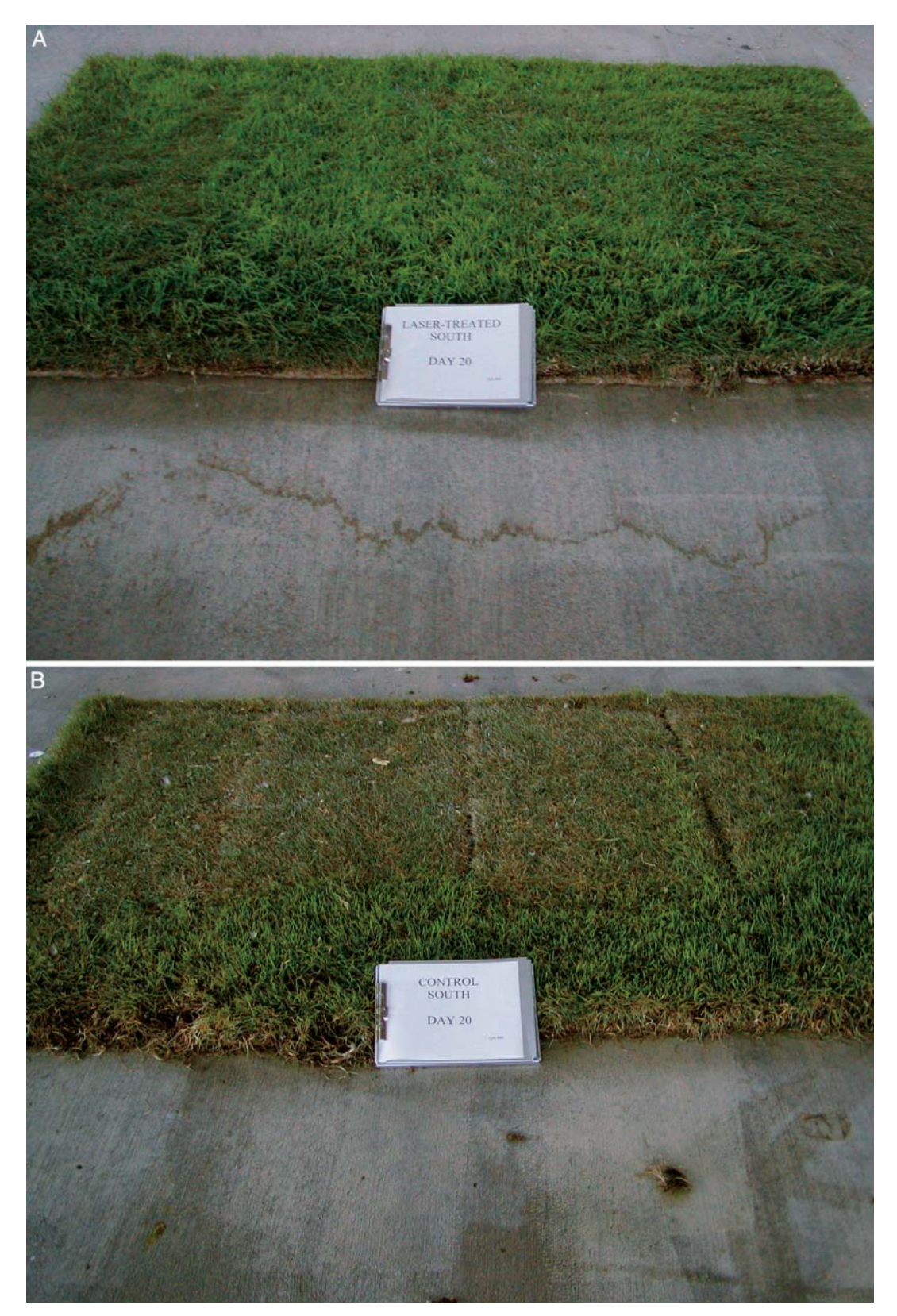
Figure 3. Grass sod from a laser-hazed (A) and control (B) subplot subsequent to the 20-day habituation test of a laser hazing system for repelling Canada geese.